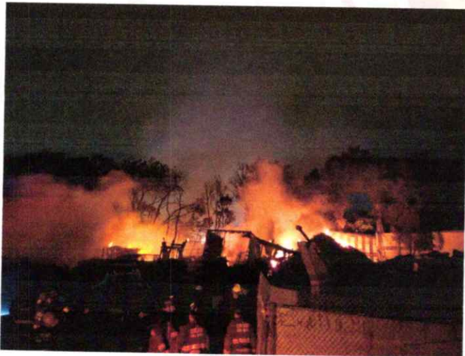
Charles Barango Memorial Ride September 17, 2020

Battalion 7 and units responding to a Still alarm at 4501 Addison St. Upon arrival Battalion 7 reports a fire in a 1 story factory 200x200. Fire on the roof. A Box was pulled by Battalion 7. 2 master streams and Squad 2 working. 2-2-2 took command of the fire and requested the rehab unit to the scene and everyone going defensive. A 2-11 requested by 2-2-2 w/a Level 1 HAZMAT. At this time 3 master streams working and Squad 2. Heavy fire in the rear. Canteens 401 & 405 responding to the fire now. 2-1-24 arrival and took command of the fire now. The fire was quickly brought under control and struck out by 2-1-24.