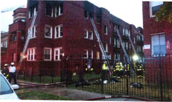
2-11 Alarm Austin Ave. & Bloomingdale Ave. September 6, 2020.

Battalion 8 and the group responding to smoke in the area. Upon arrival Battalion 8 reported a fire in the rear of a construction company. Due to water availability he requested a Box. Company's needed to go inline to supply water to the fire. 2-2-2 took command of the fire and requested a 2-11 alarm due to the location of the fire. Description was a large pile of construction waste. Canteen 401 responded at this time. 2 lines working with the Squad 2. The fire was struck out shortly.