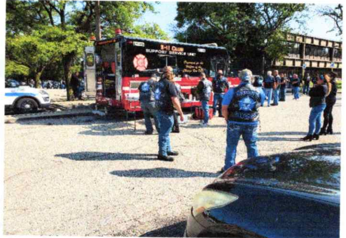
2-11 Alarm Fire w/a Level 1 HAZMAT at 4501 Addison St. September 13, 2020

Battalion 8 and the group responding to smoke in the area. Upon arrival Battalion 8 reported a fire in the rear of a construction company. Due to water availability he requested a Box. Company's needed to go inline to supply water to the fire. 2-2-2 took command of the fire and requested a 2-11 alarm due to the location of the fire. Description was a large pile of construction waste. Canteen 401 responded at this time. 2 lines working with the Squad 2. The fire was struck out shortly.