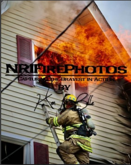
01/10/20 3rd alarm Central Falls, RI 45 Jenks Ave dwelling fire