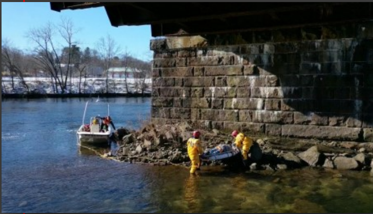
01/20/20 Derby, CT Bridge St water Rescue