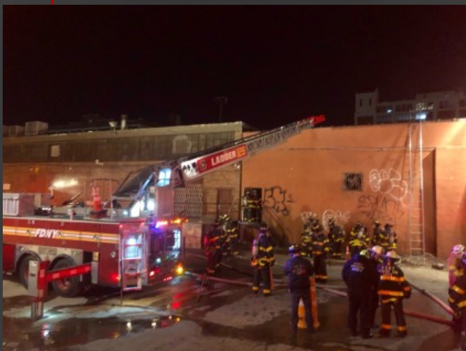
01/29/20 Queens, NY 29th St commercial building fire