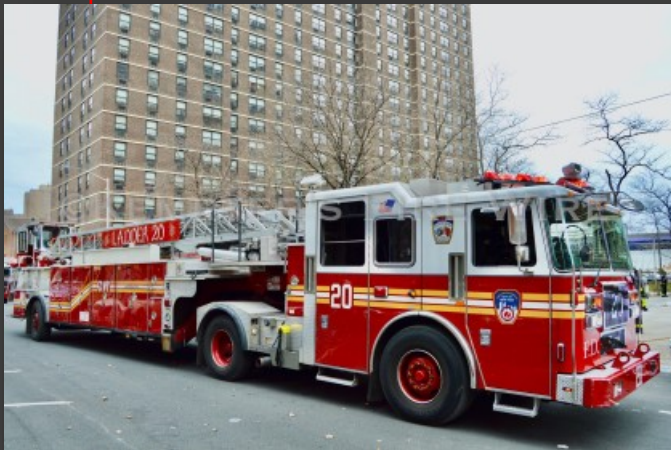
01/11/20 Manhattan, NY High Rise Cherry St.