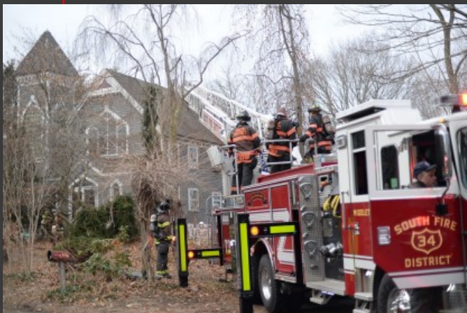
01/11/20 Higganum, CT Old Saybrook Rd. dwelling fire