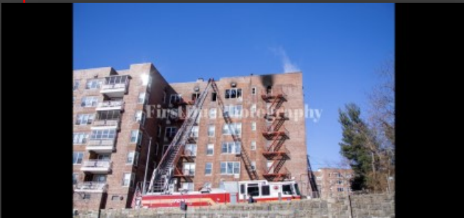
01/21/20 3rd alarm Bronx, NY 601 Kappock St. fire in an OMD