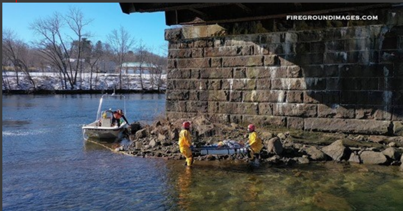
01/20/20 Derby, CT Housatonic River water rescue

An International Fire Buff Associates Region 1 Club