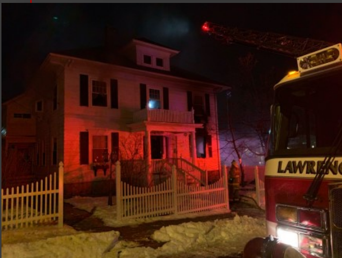
01/23/20 Lawrence, MA 5 Sacksonia Ave dwelling fire—Lawrence firefighters were quickly able to knock down a fire on floor 1 earlier this evening on Saxonia Ave. An elderly male & cat died as a result of the fire while all other occupants escaped unharmed Kevin White