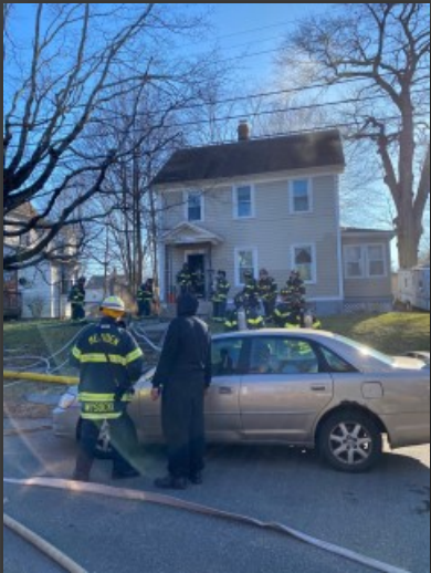
01/29/20 Meriden, CT 162 Buckingham St. dwelling fire