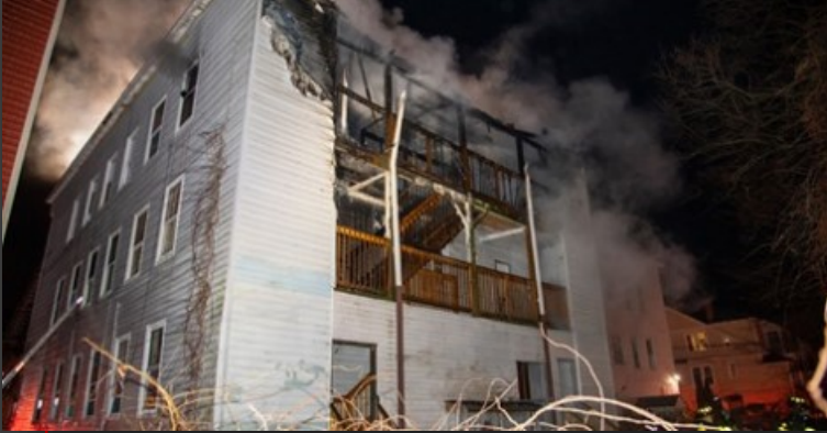
01/06/20 Bridgeport, CT Maplewood and Norman dwelling fire