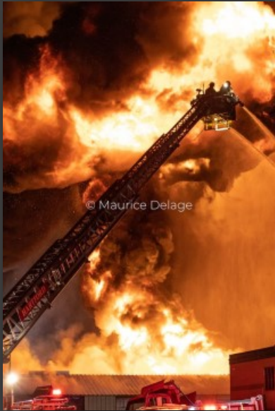
01/28/20 2nd alarm plus Hartford, CT 195 Maxim Rd. commercial building fire