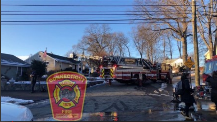
01/20/20 Bridgeport, CT 20 Donald Ct. dwelling fire