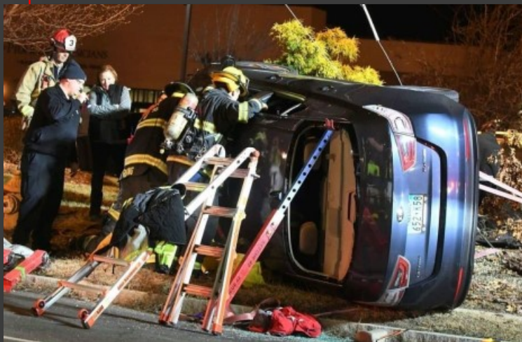
01/07/20 Manchester, CT W. Middle Tpke MVA pin job