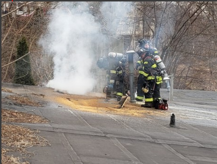
01/07/20 Ansonia, CT Beaver St. commercial garage