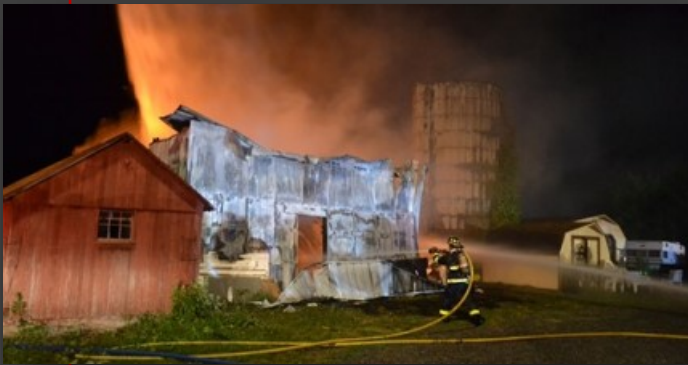
07/17/20 Lima, NY Rochester Rd. barn fire