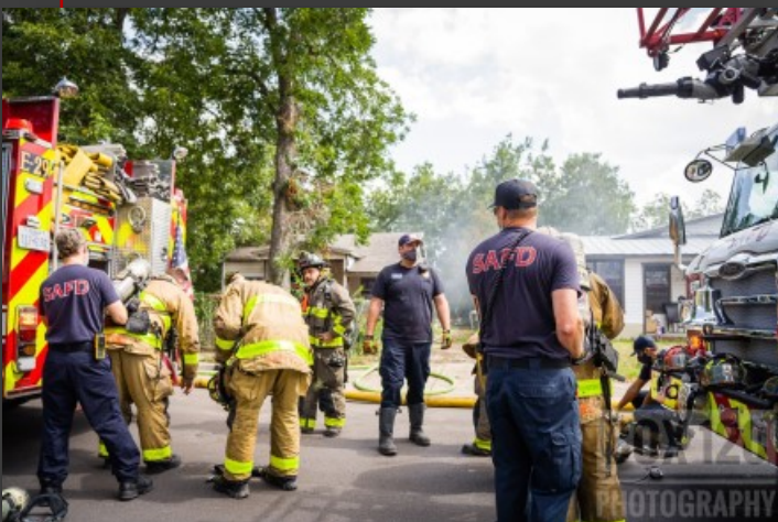
07/30/20 San Antonio, TX Villareal dwelling fire - Engine Co. No. 29 stretched on a working fire in the 200 Villareal St on the cities east side. Engine 29 checked on location with heavy fire throughout the Charlie side of a single story, single family dwelling.