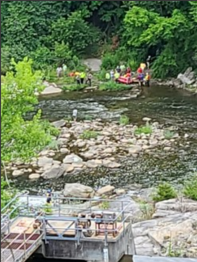
07/22/23 Salisbury, CT 326 Housatonic River Rd. technical rescue Ed Harvey