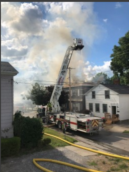
07/14/20 Geneseo, NY Ward Pl. dwelling fire