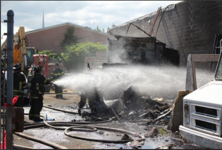
07/16/20 Bridgeport, CT 165 Lee Ave dump truck against building