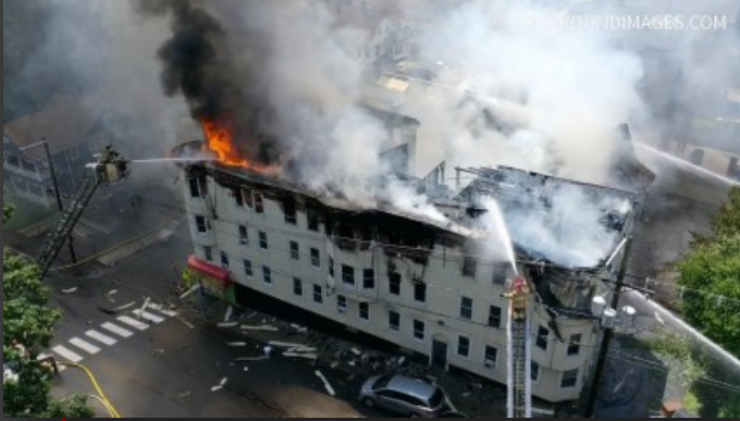
07/13/20 3rd alarm Waterbury, CT 23 Colley St multiple dwellings