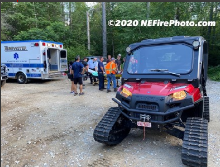
07/30/20 North Conway, NH Black Cap Trailhead injured hiker