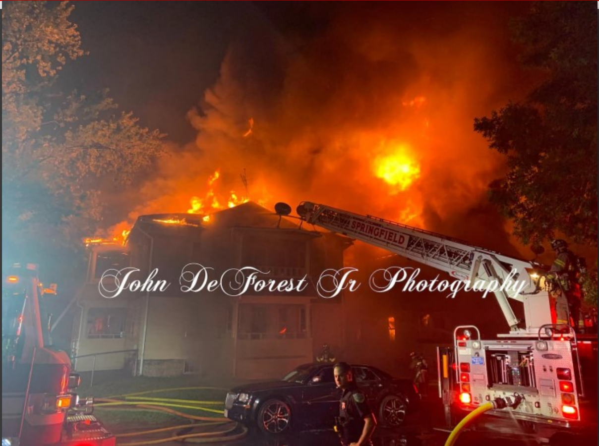
07/11/20 2nd alarm Springfield, MA

An International Fire Buff Associates Region 1 Club