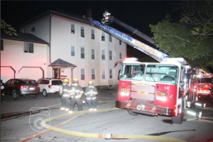
07/30/20 Worcester, MA Dartmouth St. dwelling fire