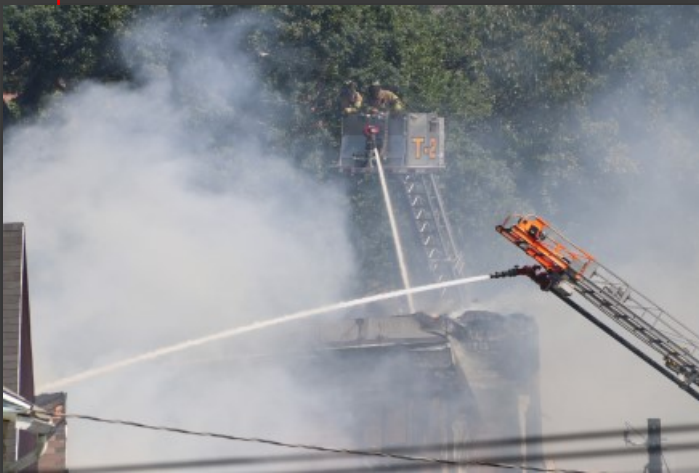
07/13/20 3rd alarm Waterbury, CT 23 Colley St. multiple dwellings