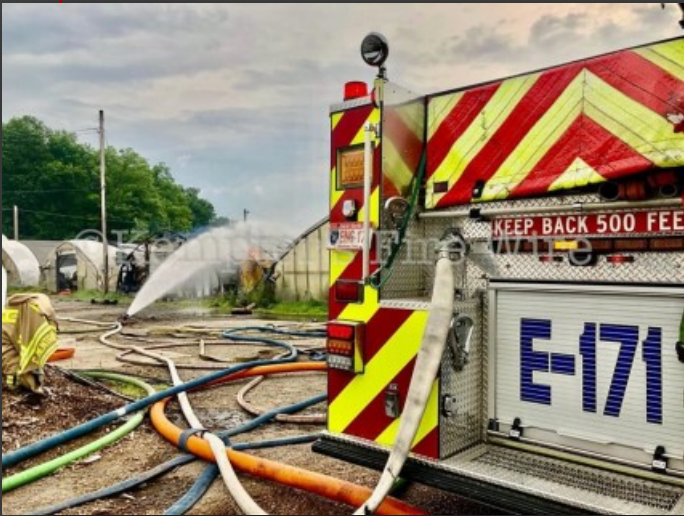
07/22/20 Scarsdale, NY 450 Secor Rd. greenhouse fire Dave Kempter