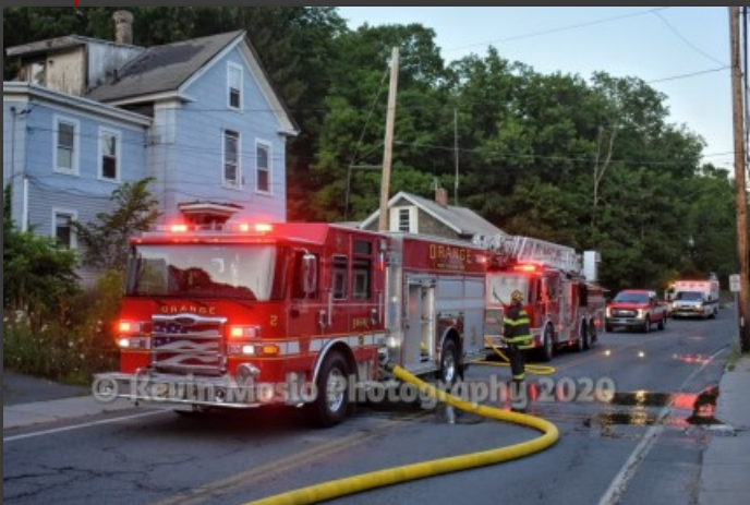
07/17/20 Orange, MA 80 West Main St. dwelling fire—Calls came in for a reported building fire at 80 West Main St in Orange. First in crews encountered a kitchen fire and made quick work of it. Mutual aid was requested and enroute, but diverted to cover or cancel. Crews remained on scene for a few hours to ventilate the building, overhaul and clean up equipment.