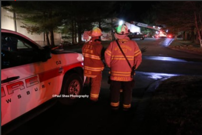
03/05/20 Shrewsbury, MA Supercan Inc. 830 Boston Tpke. Hazmat fire