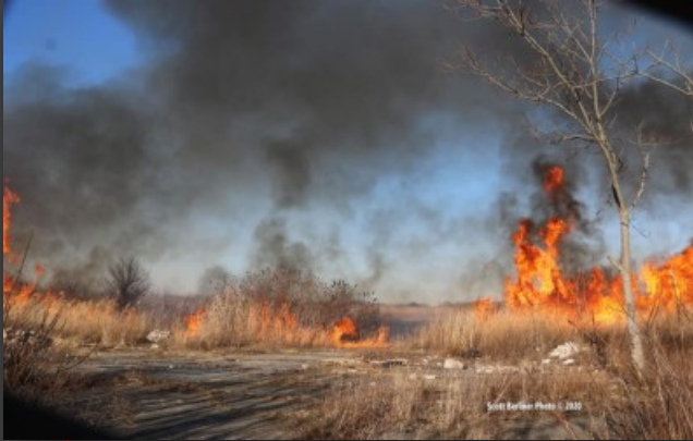
03/01/20 Brooklyn, NY Boz 3676 Florence and Gerritsen Aves. brush fire