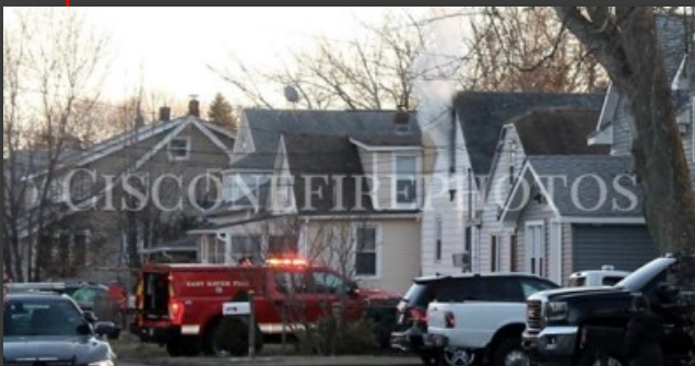
03/01/20 East Haven, CT 128 Henry St. dwelling fire