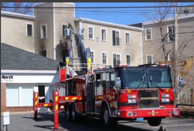
03/01/20 Danvers, MA 20 Locust St. vacant dwelling fire