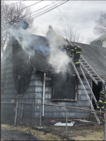
03/14/20 Hartford, CT 65 Winchester St dwelling fire