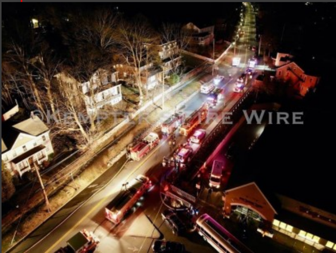
03/11/20 Peekskill, NY 1214 Main St. dwelling fire