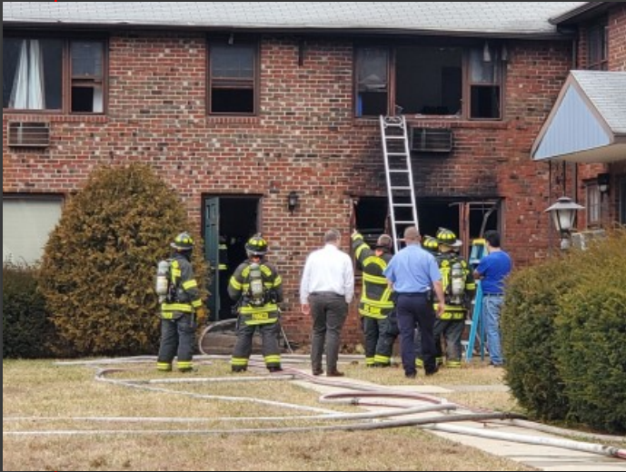
03/03/20 191 Southington, CT 191 Queen St. apartment fire