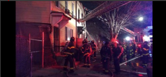
03/14/20 Brooklyn, NY 179 Sumpter St. dwelling fire