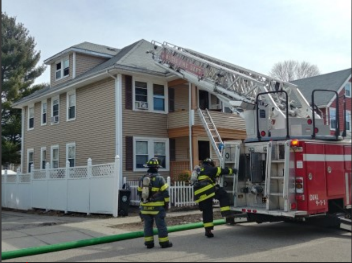
03/08/20 2nd alarm Milton, MA 24 Laurel Rd. dwelling fire