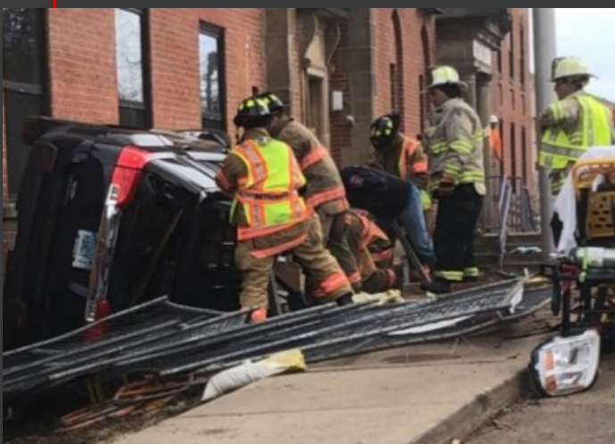
03/03/20 Wethersfield, CT 170 Ridge Rd. MVA rollover Pin Job