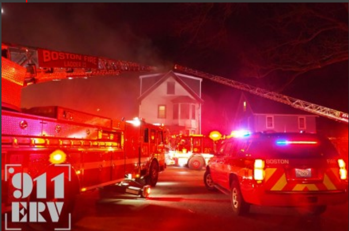
03/08/20 Boston, MA 27 Bloomington St. dwelling fire