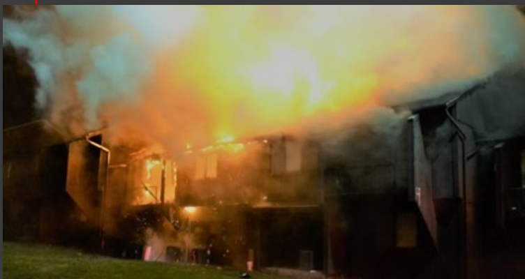
03/05/20 Scottsville, NY Robert Quigley apartment building