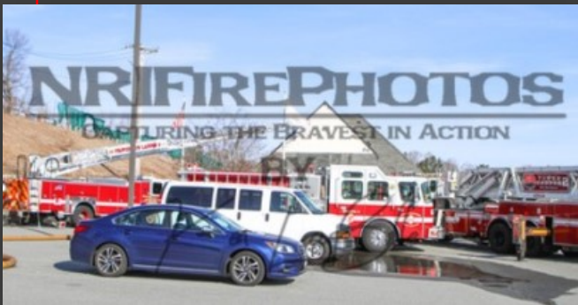
03/11/20 2nd alarm Providence, RI 1 Buttonhole Dr. commercial building