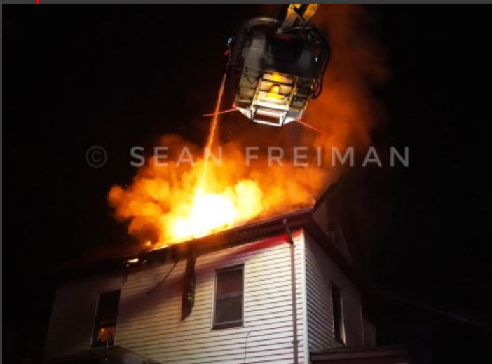
03/08/20 Hartford, CT 29 Ashley St. dwelling fire