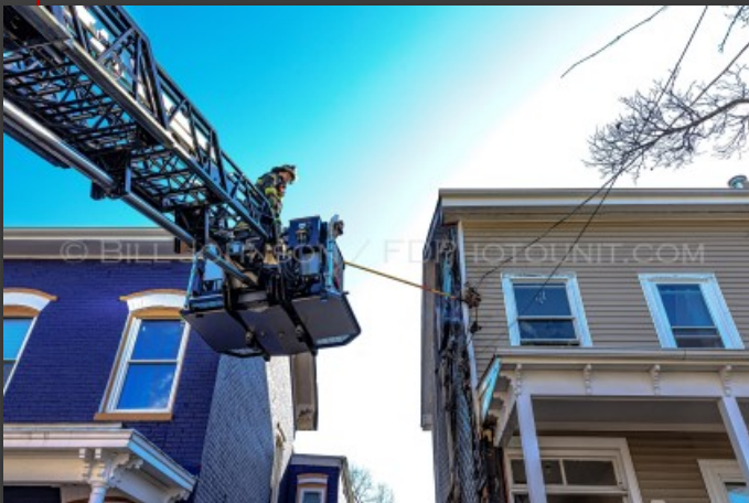
03/14/20 Poughkeepsie, NY 24 High St. dwelling fire—City of Poughkeepsie assisted by Fairview as the F.A.S.T., Mobile Life Paramedics, and City of Poughkeepsie PD operated at this structure fire at #24 High Street. Units were dispatched by City 911 for garbage burning along the side of a residence and when they arrived they had an active fire on the "B" side of the structure also involving the electrical service to the building. Firefighters quickly knocked the majority of the fire down but were unable to completely extinguish it because the electric service was also burning. Central Hudson was requested with a rush as firefighters held the fire in check and awaited their arrival. Once the power was cut, firefighters extinguished the fire only after they chased the same through numerous voids.