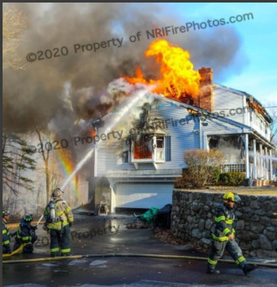
03/05/20 Millville, MA 160 Thayer St dwelling fire