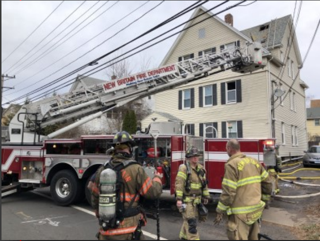
03/11/20 2nd alarm New Britain, CT 841 East St. dwelling fire