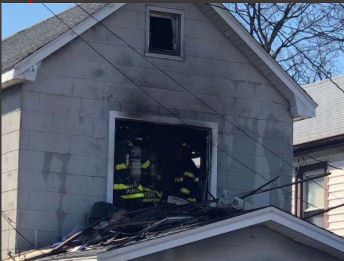
03/03/20 Queens, NY 114-26 149th St. dwelling fire