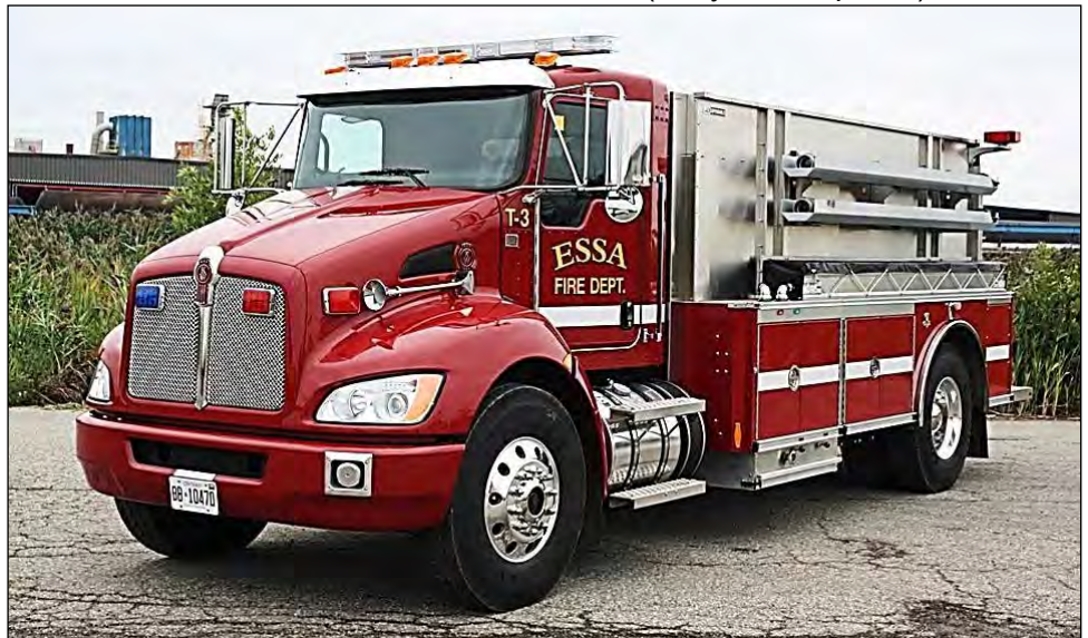
Essa Twp., Tanker 3, a newly received Kenworth/HME Ahrens Fox.