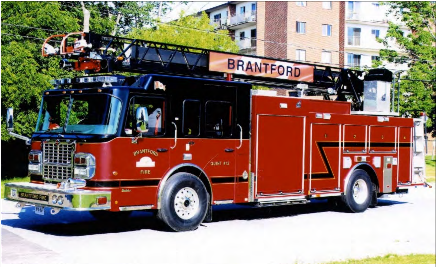
Brantford, ON Quint 12 is a 2008 Spartan Gladiator/Smeal product with a 1500igpm pump, 400gwt and a 55' aerial.