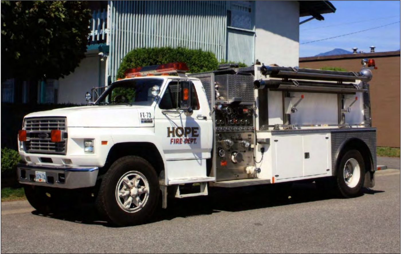
Hope, BC Tanker 1-5. 1990 Ford F800/Hub 840igpm pump/1400gwt.