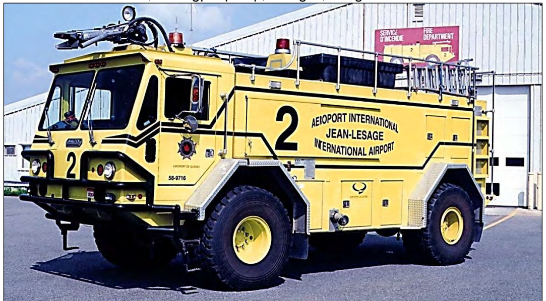
Red 2 was a 1997 Waltek 5500, 625igpm pump,1250gwt, 145gft and 500lbs DC.