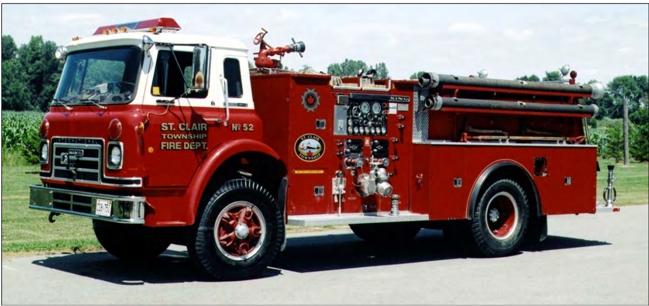
St. Clair Shores #52 in Port Lambton, ON was a 1980 IHC CO1810/King Seagrave, 840igpm/1000gwt.