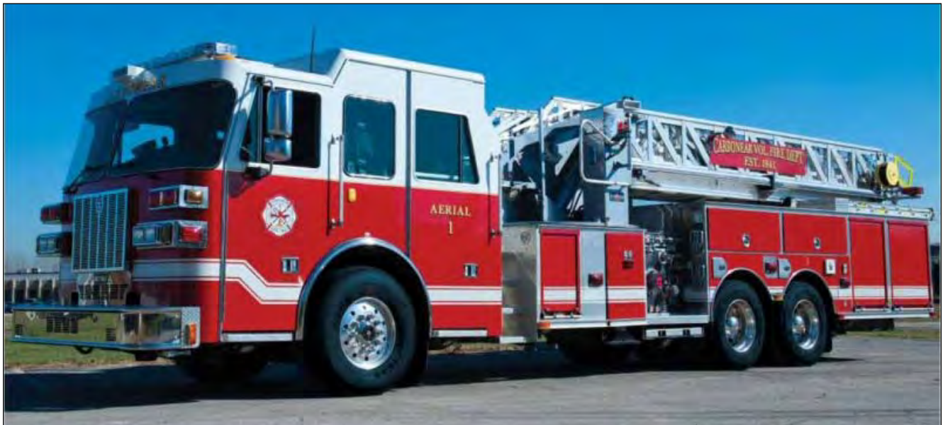
Carbonear, NL Aerial 1 is a 2009 Sutphen 100 tower, rehabbed by Fort Garry. It has a 1500igpm pump and 330gwt