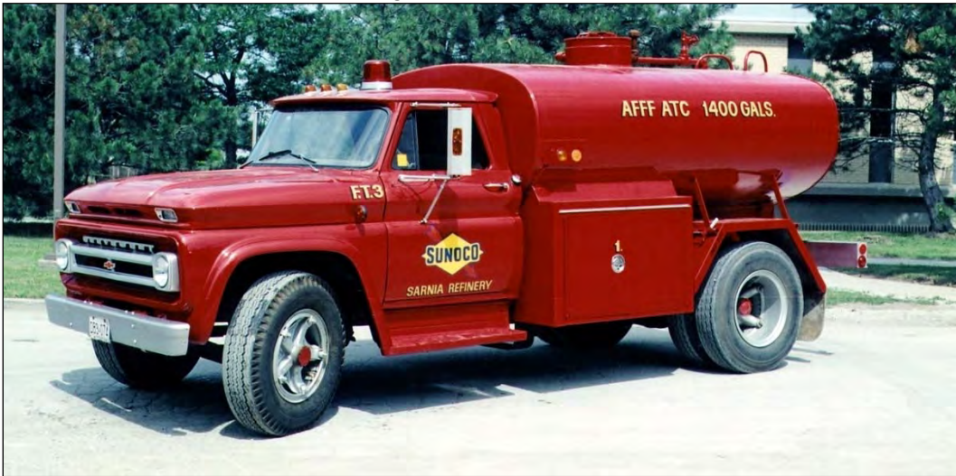
Suncor, Sarnia, ON FT.3 was a 1963 Chevrolet/MTI 1400gallon foam tanker.