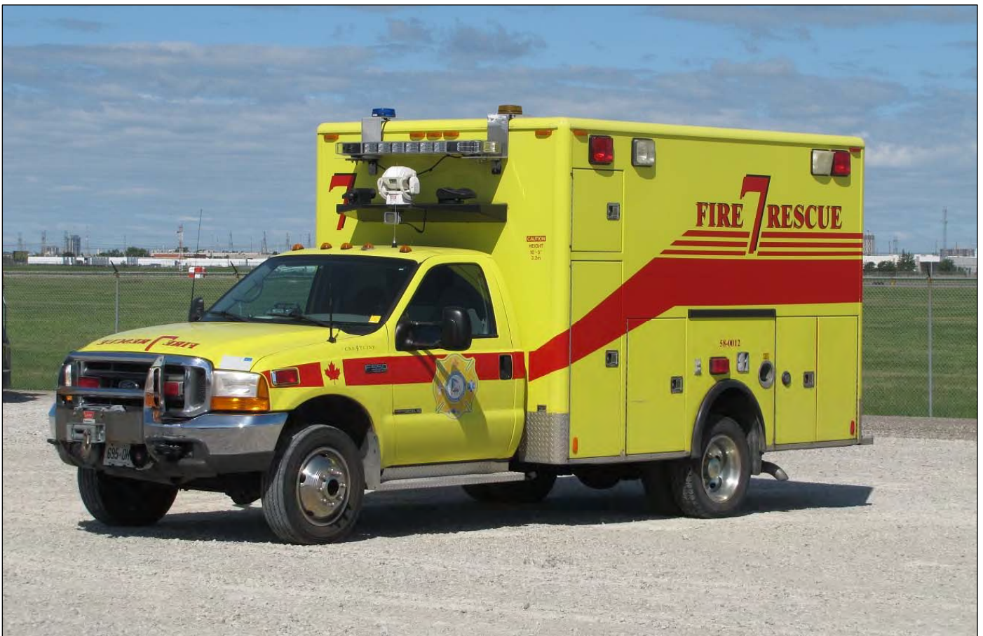
A look at Pearson Airport (Greater Toronto Airports Authority) in 2012, Red 7, the command unit. It is a 2000 Ford F550/Crestline product.