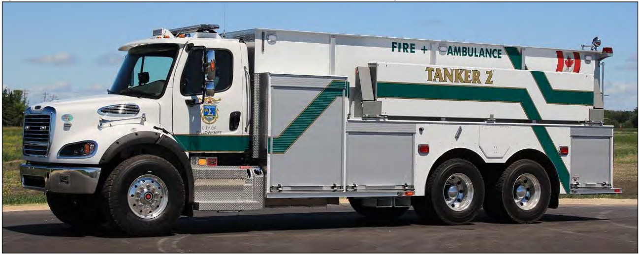
Yellowknife, NWT Tanker 2, a 2019 Freightliner M2-112 /Fort Garry rig, 440igpm pump & 3000gwt.