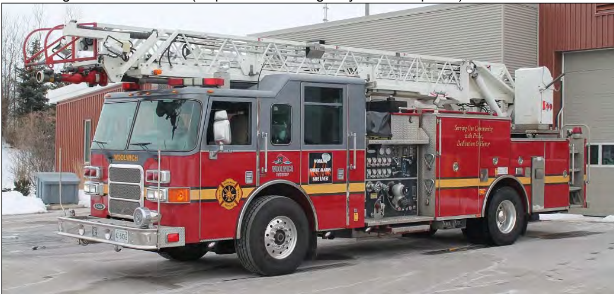
Woolwich Twp. ON 463 is a 2002 Pierce 75' quint with a 1250igpm pump and a 416gwt. It was acquired through Brindlee Mountain and runs from Breslau.