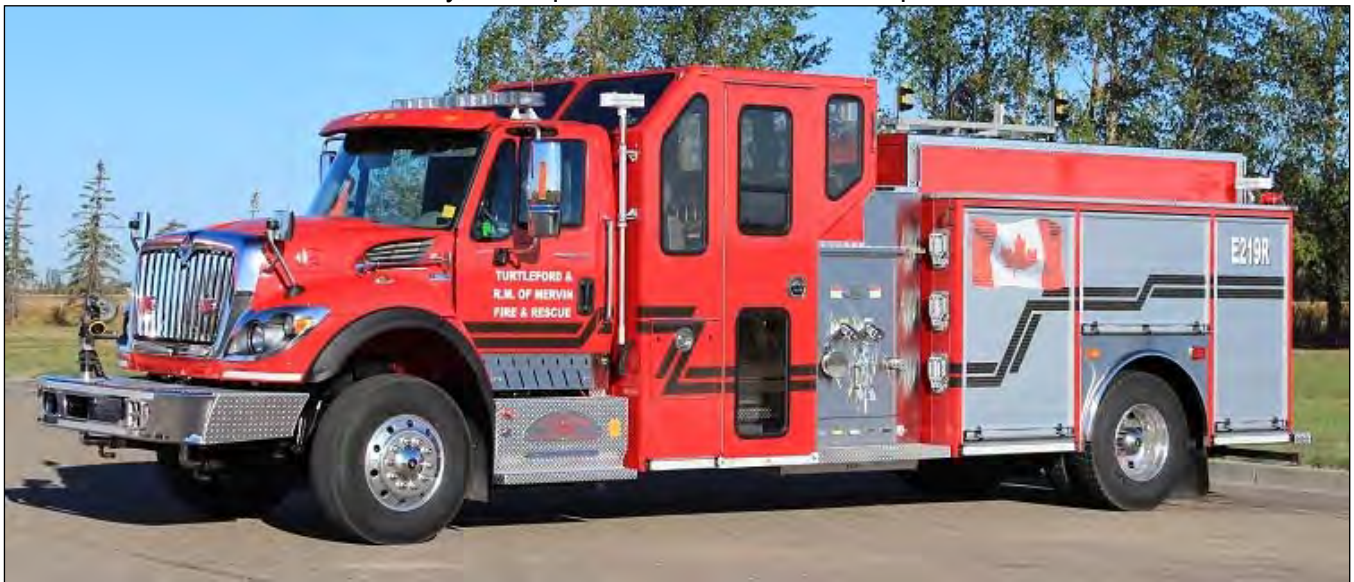
Turtleford, SK Engine 219R - 2012 International 7400/Green Acres 1050igpm pump/1000gwt/25ft.