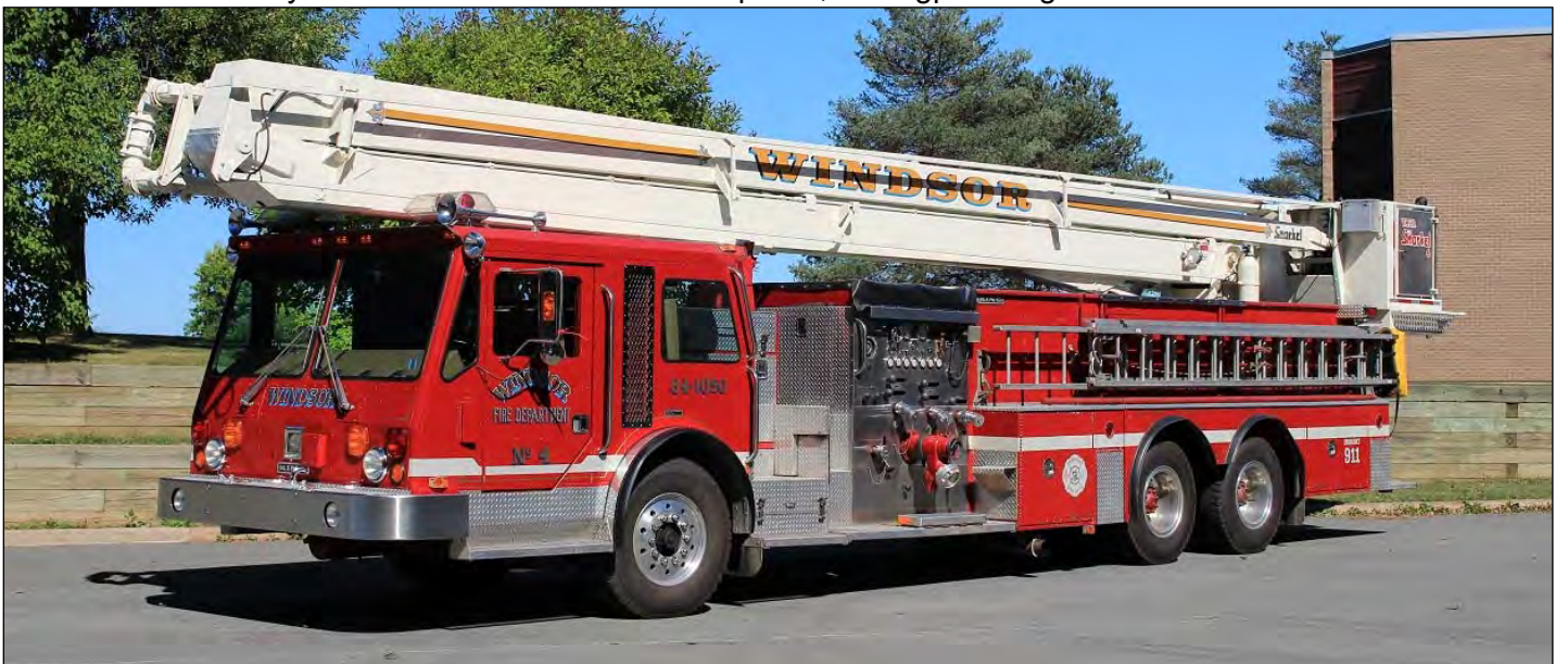
This 1984 King Seagrave tower is still in use with Windsor, NS Snorkel 4 has a CM-1 chassis, a 1050igpm pump and an 85' platform. SN 840029.