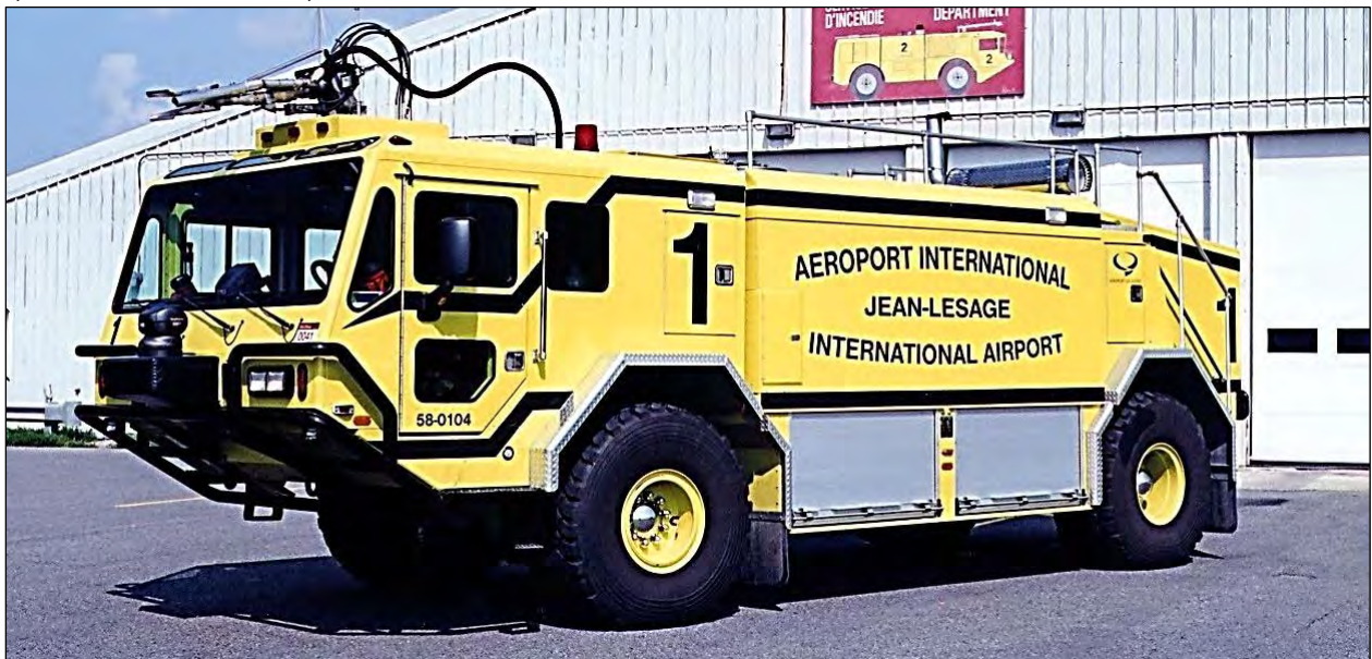
Red 1 was a 2001 Waltek P4-7500 , 1250igpm pump,1665gwt, 187gft and 500lbs DC