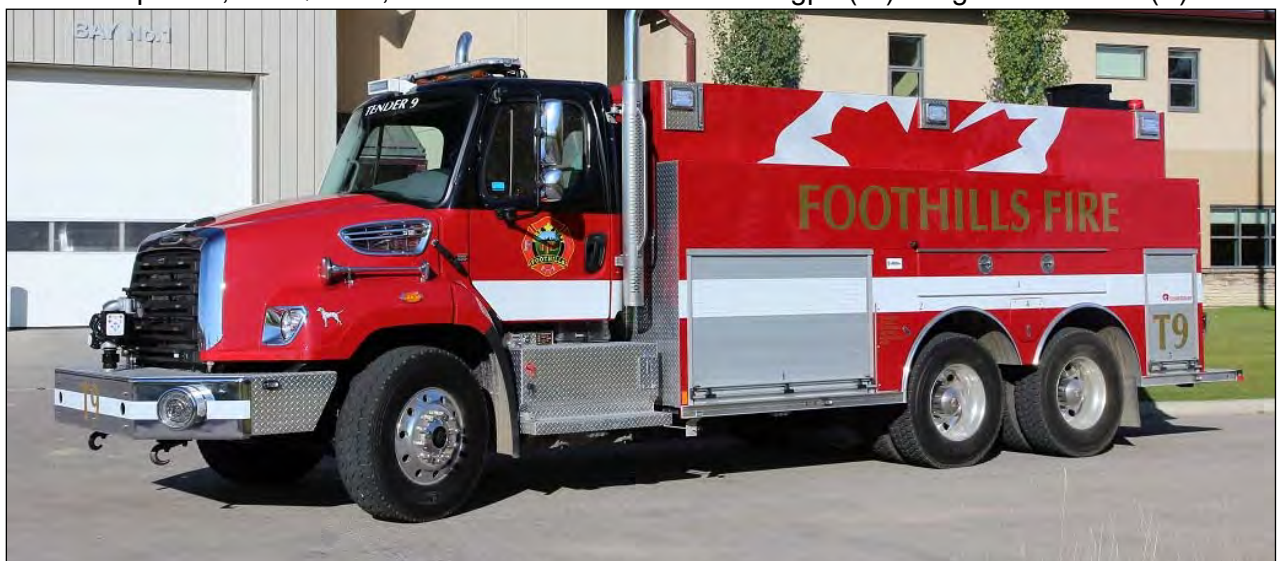
Foothills, AB Tender 9 is a 2019 Freightliner 114 SD / Rosenbauer collaboration equipped with a 625igpm pump and a 3500gwt.