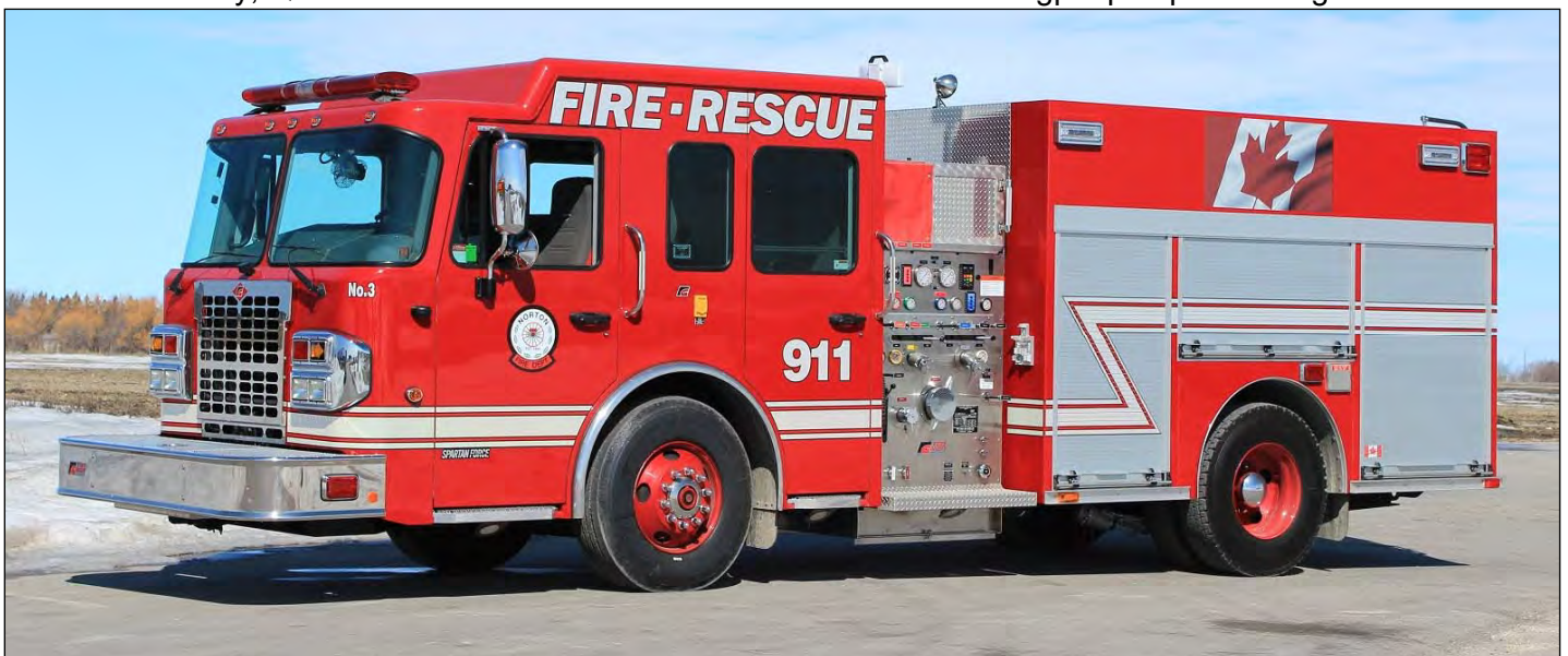
Norton, NB No.3 is a 2011 Spartan Metro Star/Fort Garry pumper, 1050igpm/800gtw/25gft SN M296