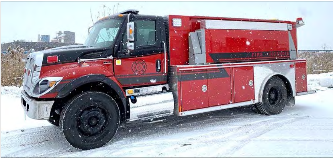
Greater Sudbury recently received two 2019 International HV607/Dependable tankers, they Both have 1500 gallon water tanks.