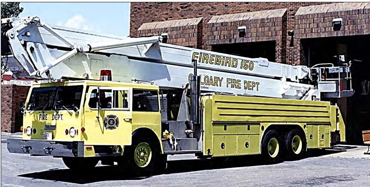
Calgary AB ran this 1976 Calavar Firebird 150' Platform for many years.