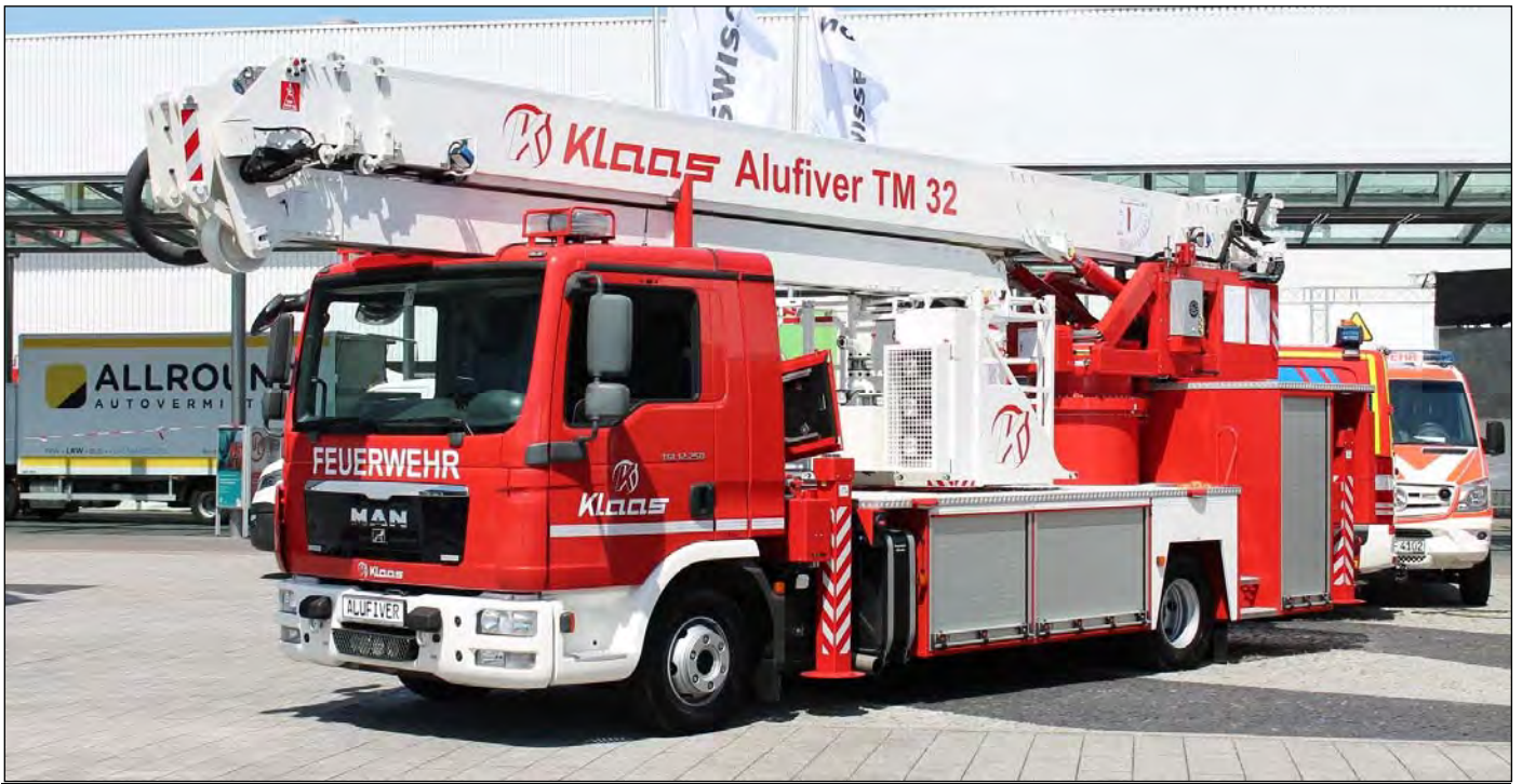
Seen at Interschutz in 2015, a Klaas Alufiver TM 32 platform on a MAN TGL 12.250 chassis. (Dan Goyer)