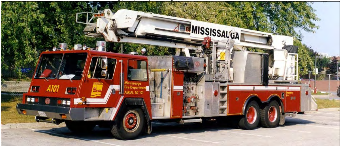
Mississauga ON A101 as a unique 1983 Pierreville Pemfab 100' aerial converted by Anderson in 1987 to a 92' Bronto. It had a 1050igpm pump and 200gwt.