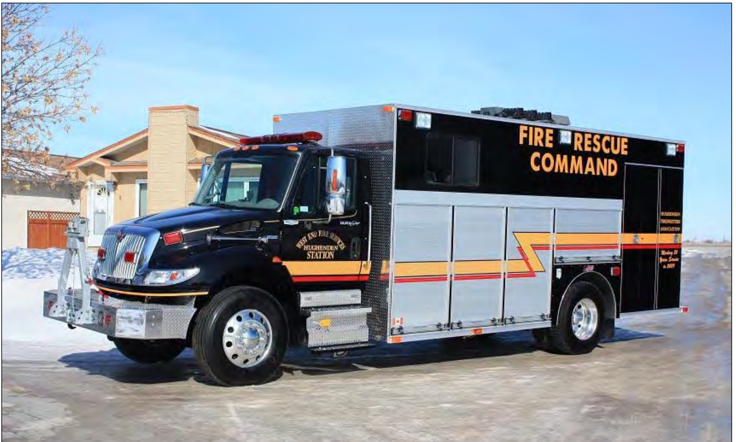
Hughenden, AB's Command Unit is a 2009 International DuraStar / Fort Garry walk-in rescue.