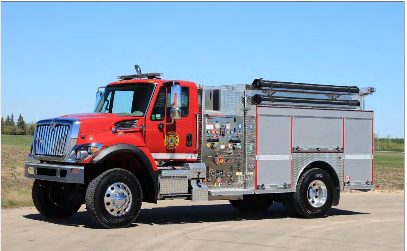
The Miawpukuk First Nation at Conne River, NL operates this 2017 International 7400 4x4 / Fort Garry pumper. It is equipped with a 1050igpm pump, a 1000gwt and a 25gft. (SN#M794)