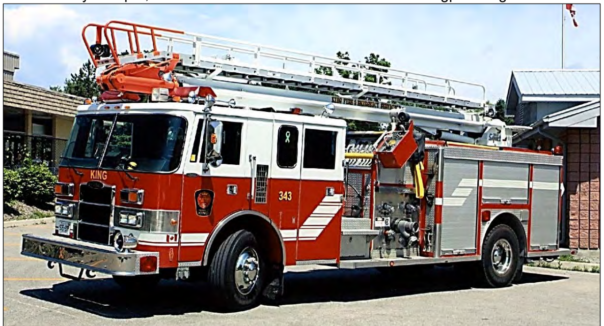
King Twp., ON #343, a 1990 Pierce Lance Superior 1050igpm/500gwt/50' aerial.