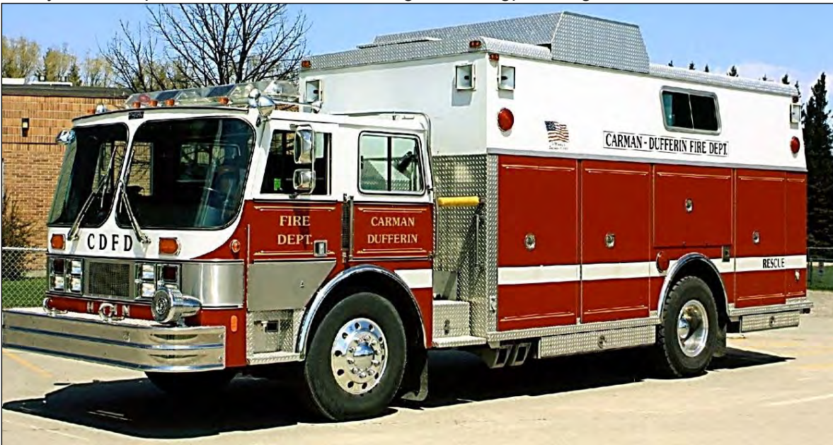
Carmen Dufferin, MB Rescue 1, a 1986 Saulsbury Hahn rescue ex-Westmere, NY