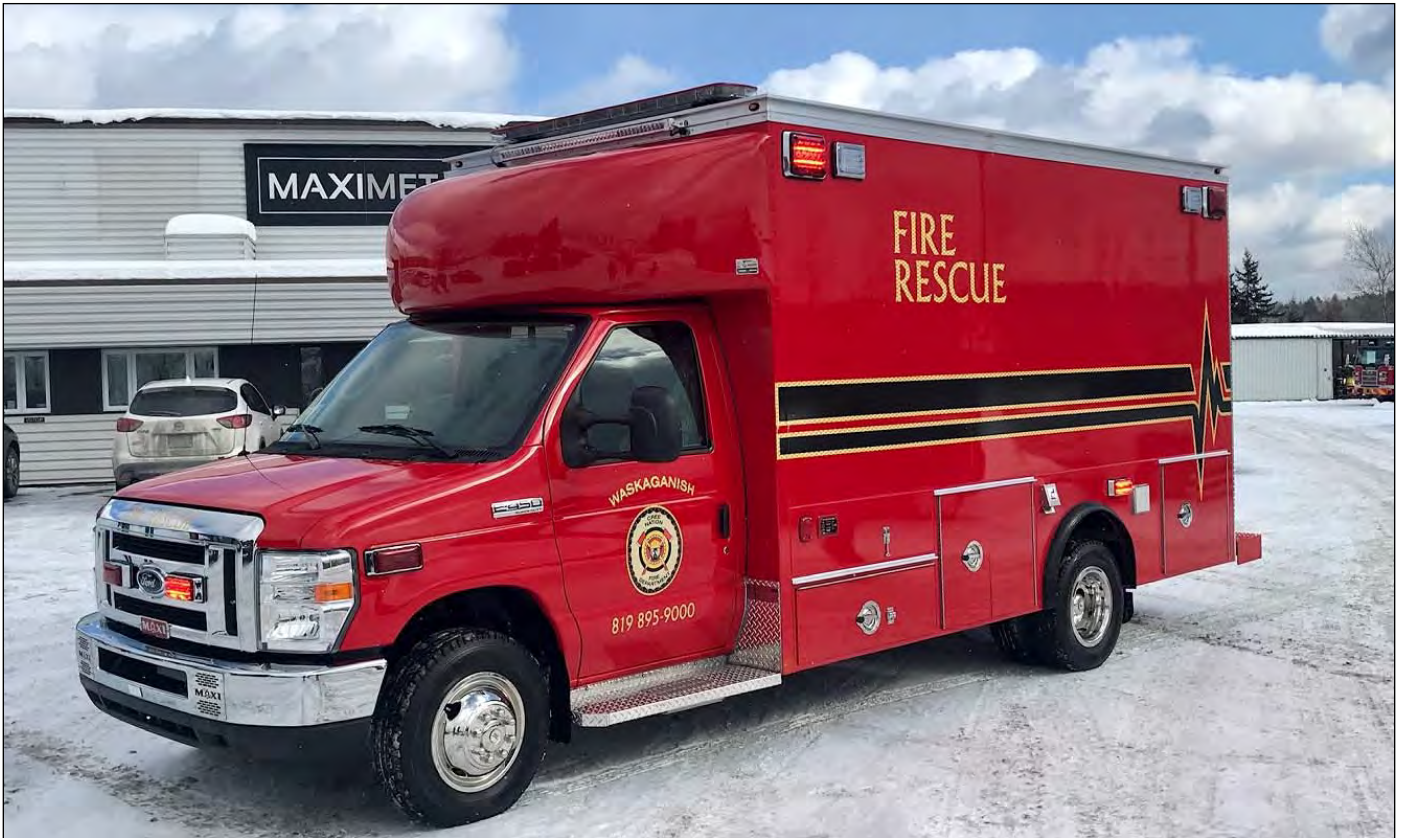
Waskaganish Cree Nation in Fort Rupert, QC just received this 2019 Ford E350/Maxi Métal I Reflex light rescue.