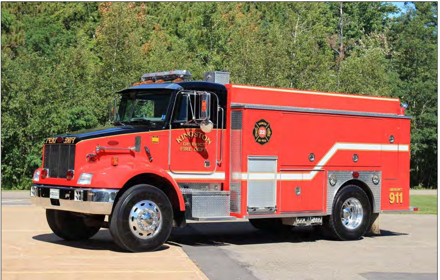
Kingston, NS Tanker 22, a 1999 Peterbilt / LRB Fabricators unit, 500igpm pump and 1600gwt.