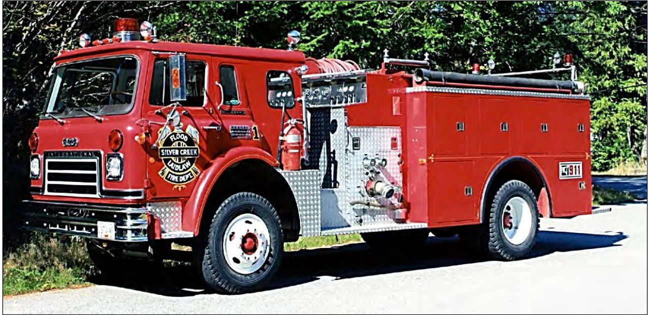
Flood Laidlaw, BC #11978 Int'l CO1910 /Hub pumper with a 625igpm pump and 1000gwt.