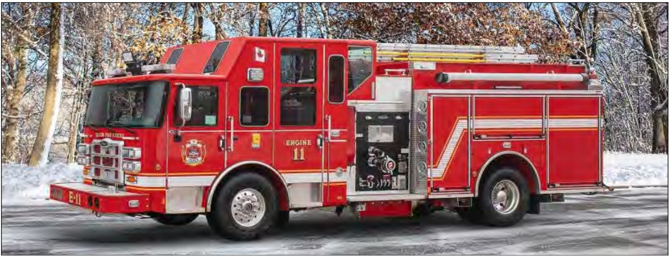
Taylor, BC Engine 11 now has this 2020 Pierce Enforcer with a 2000gpm Waterous pump, 850gwt, 50ft and a Husky 3 foam system. sn 33909