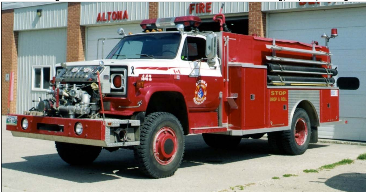
Altona, MB #442 1983 GMC C7000 Superior 840/750 Se497