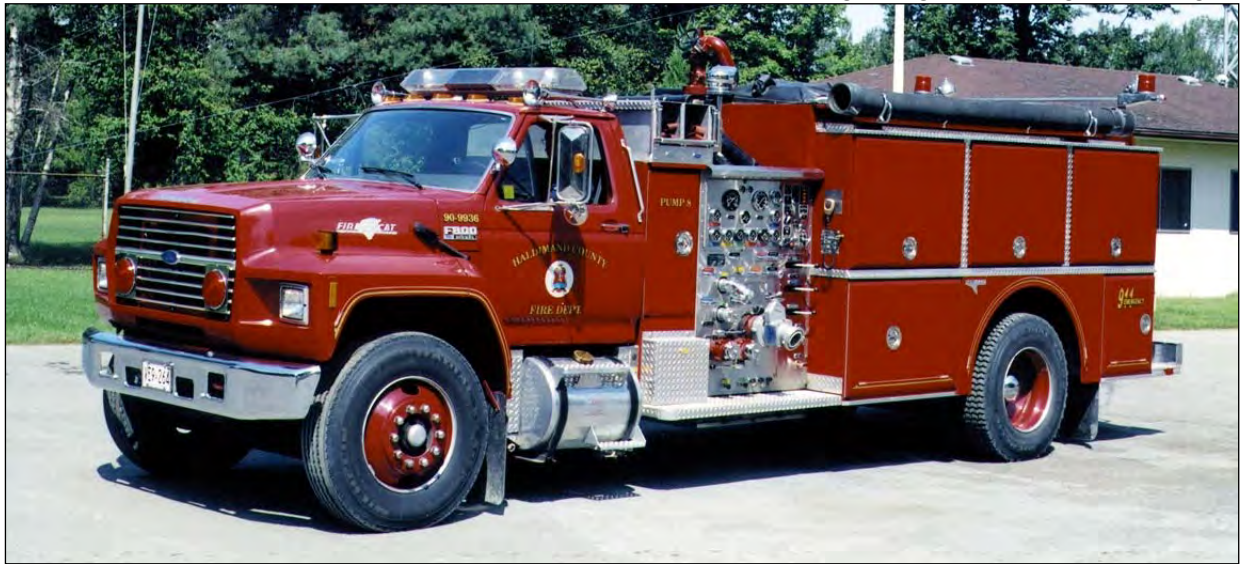
Haldimand County Pump 8, a 1990 Ford F800/Grumman Fire Cat 1050igpm/840gwt.