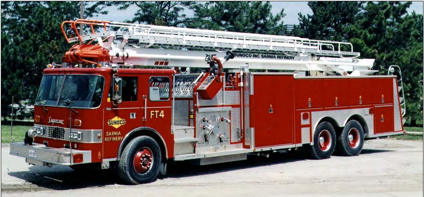
Suncor FT.4 had a 1991 Pierce Dash Superior quint with a 1500igpm pump, 1000gft & /75' aerial. SE1126