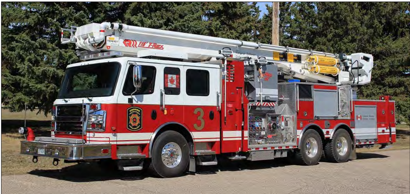
One of the DND T Rex platforms, Red 3 at CFB Shilo. Built on a Commander chassis, it has a 1750igpm pump, a 300gwt and 115' tower.

In Canada, Rocky Mountain Phoenix delivered a number of B series articulated platforms, known as the T Rex in North America, to a number of industrial and municipal fire departments, particularly in Alberta during the oil exploration boom. Montreal operates a fleet of T Rex ALP's and the Canadian Department of National Defense also ordered a fleet of T Rex units for use at larger Canadian military bases.