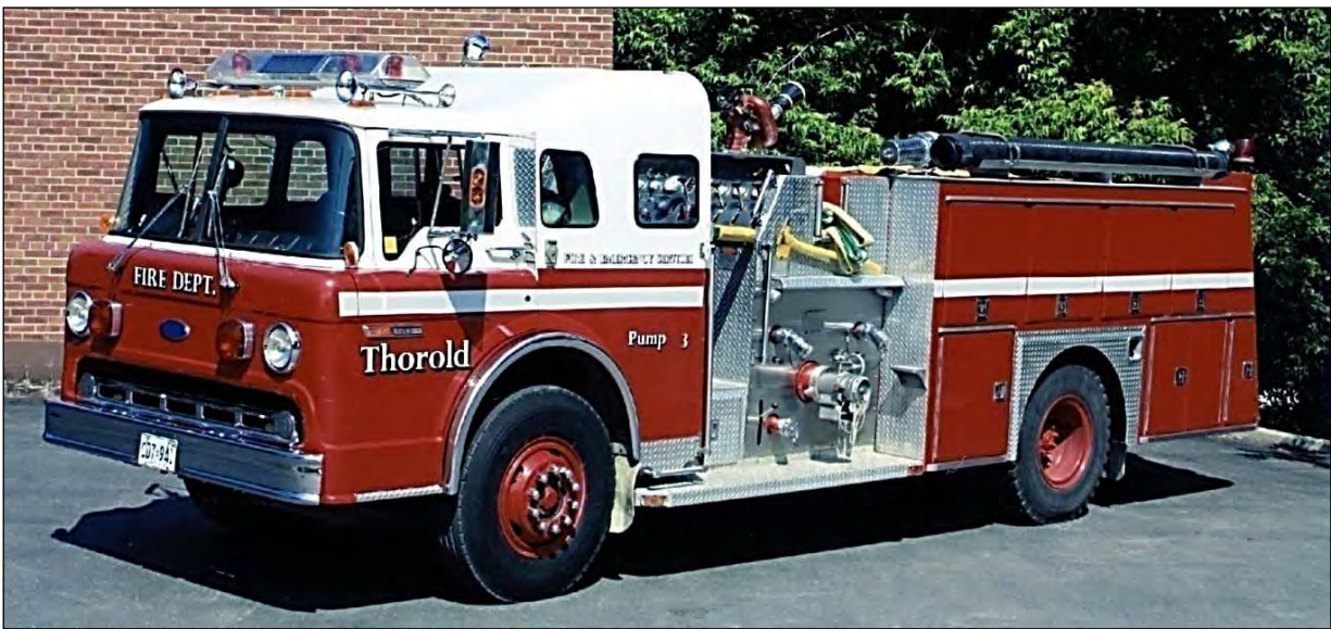
Thorold, ON Pump 3, a 1989 Ford C8000/Dependable, 1050igpm pump, 500gtw.