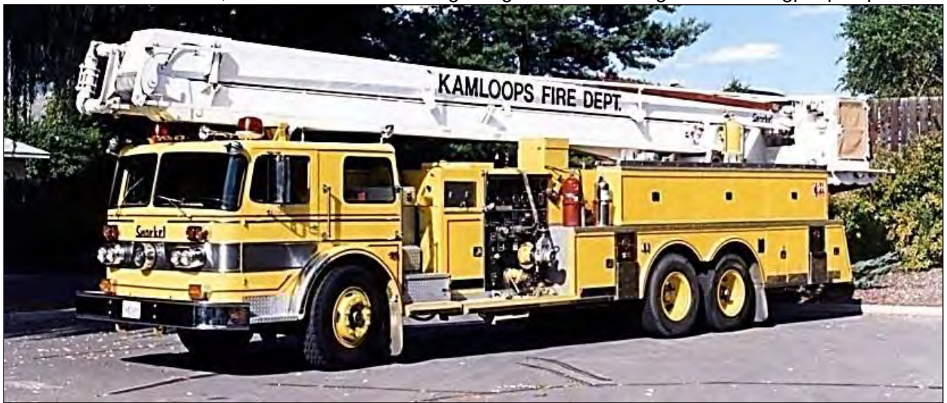
Kamloops, BC ran a 1972 Pierce Oshkosh Snorkel with a 1250igpm pump, 200gwt and 75' platform.