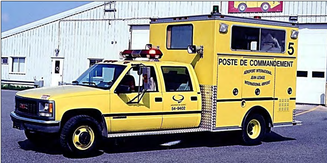
Red 5, the Command Post, was a 1994 GMC 3500 Maxi Metal Command Post.

Red 1 2001 Waltek 7500 1250/1665/187/500# DC