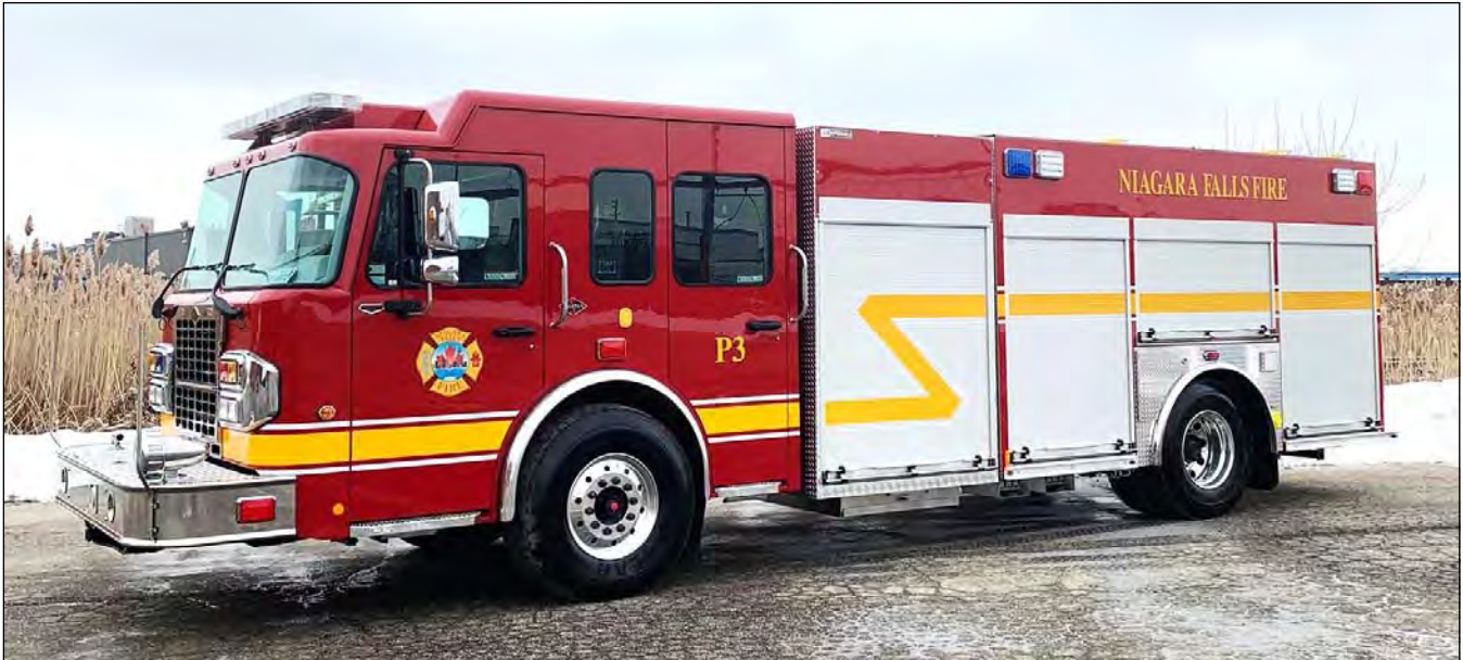
Niagara Falls, ON new Pump 3, a 2019 Spartan Gladiator/Dependable. It has a 1500igpm pump, 500gwt.