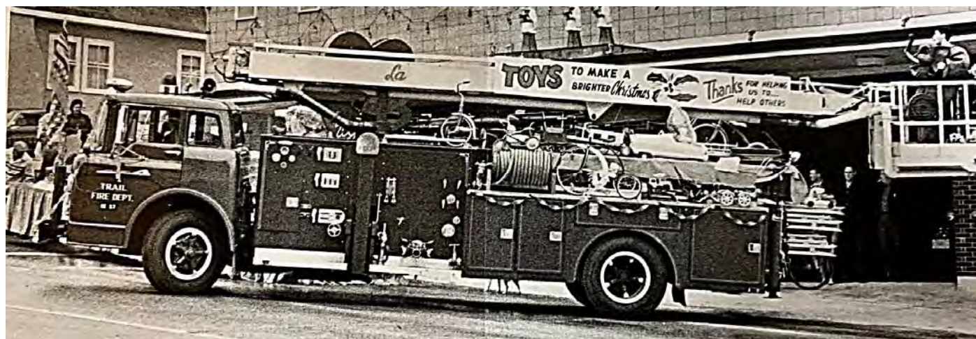
Trail, BC bought the demonstrator, mounted on a Ford C chassis.

No one seems to know for sure what happened to the original LaFrance Aerial Lift after the Trail Fire Department retired it, circa the 1980s, or if it survives.