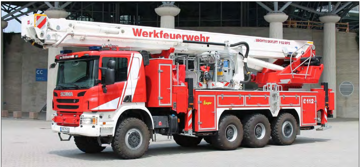
Two German Works Brigade Brontos: A 52m model on a Scania chassis with body by Zeigler, and a 44m model on a Scania P420 chassis belonging to Nynas AB, a German chemical refiner.

Attending Interschutz in 2015, hosted at the Messe in Hannover, Germany provided a great opportunity for me to ask questions of various manufacturers and it opened my eyes to several platform manufacturers that I had not previously been aware of. I would like to share with you an overview of what is available worldwide in the articulated aerial platform market and a brief background of the manufacturers, to the best of my knowledge.