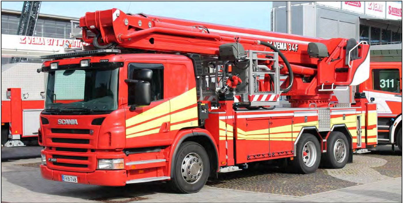
A Vema 34F demonstrator seen at Interschutz in 2015. It was placed on a Scania 360 chassis.

The Bronto F112HLA, at 112m or 335', is the world's tallest. The chassis is a 2010 Mercedes Benz Actros.