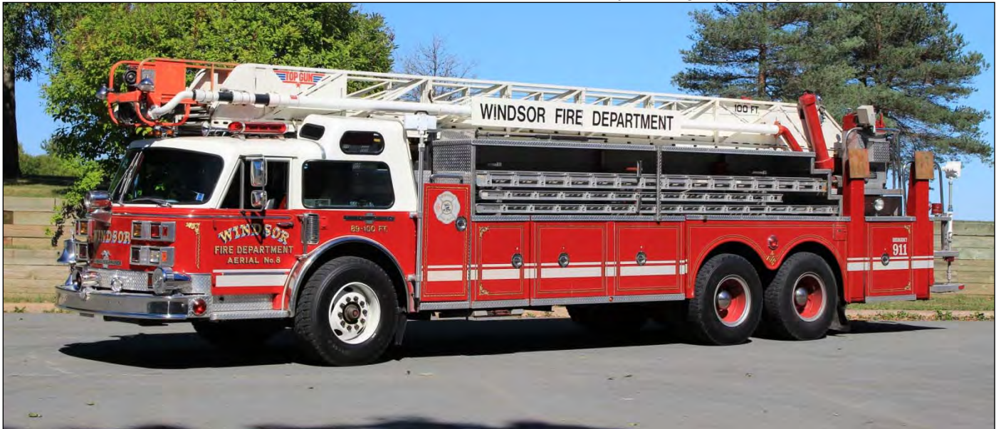
Windsor, NS Aerial 8 is a 1989 American LaFrance 100', ex Uniondale, NY.