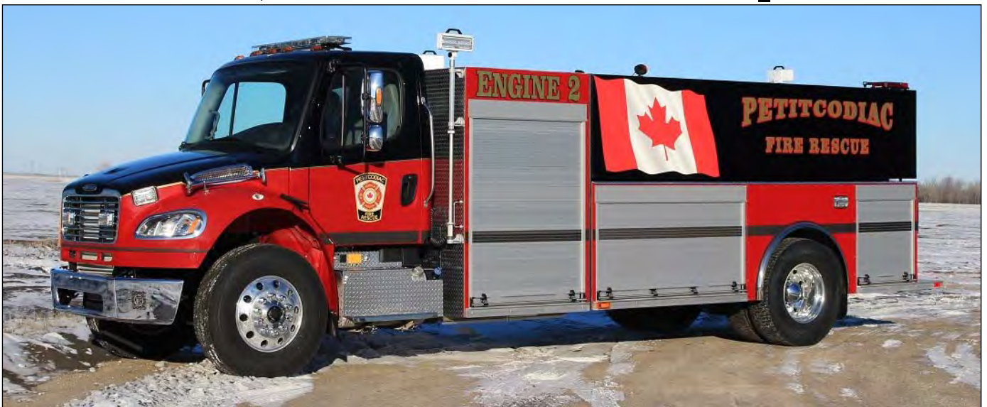
Petitcodiac, NB No.2, a 2017 Freightliner M2-106/Fort Garry pumper-tanker has a 1050igpm Hale pump, a 1200gwt and a 25gft along with a FoamPro 2001 foam system. s/n M877