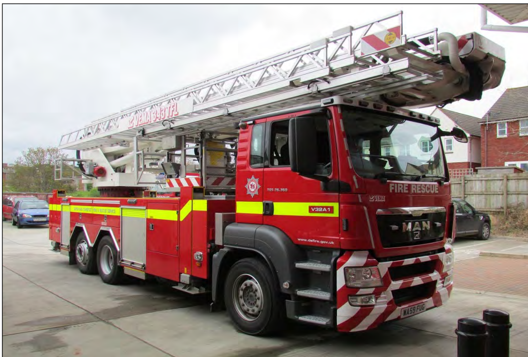
A Vema 343TFL ALP belonging to Devon & Somerset in the U.K, built on a 2009 MAN chassis.

Founded in 1988, Vema Lift Oy, located in the southern part of Finland is a member of the Kiitokori Group and builds a variety of ALP's for the fire service. The F Series is the newest range of platforms available, in heights ranging from 28 to 70 meters, the F Series offers the longest horizontal outreach of all Vema products. The TFL Series had been manufactured for many years with several hundred having been built. These units range in height from 28 to 55 meters. The TWT Series are Telescopic Water Tower units that range in height from 33 to 44 meters. For customers who prefer the CALP, Combined Aerial Ladder Pump configuration, Vema offers units ranging in height from 19 to 28 Meters.