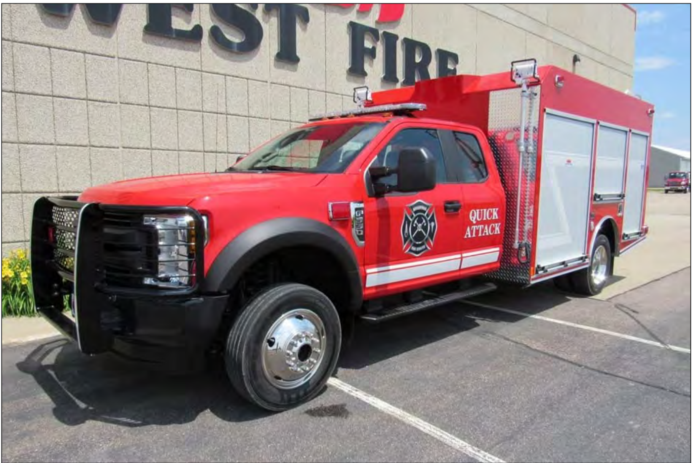
Rocanville, SK received this 2019 Ford F550/Midwest quick attack unit last year, it has a CAFS and 300gwt.