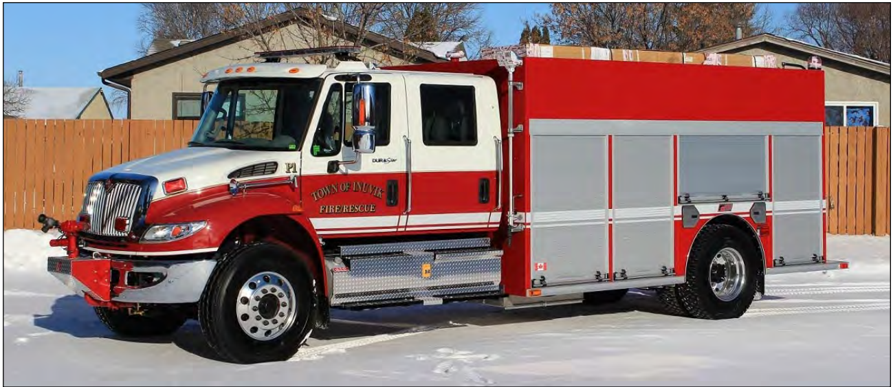
Inuvik, NWT Pumper 1, a 2013 IHC 4400/Fort Garry with a 1050igpm pump, 1500gwt and 50ft.