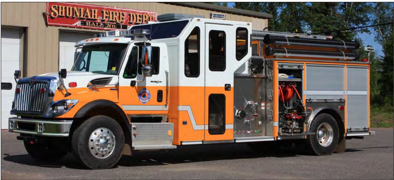
This white over orange rig belongs to the Shuniah, ON fire service. Built by Green Acres and mounted on a 2011 IHC 7400 chassis, it has a 1050igpm pump, 1000gwt, 25gft and (on display) a CAF system.