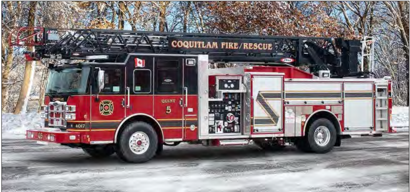
Coquitlam, BC Quint 5, a 2019 Pierce Ascendant 2000gpm(W)/500gwt/107' aerial (P)