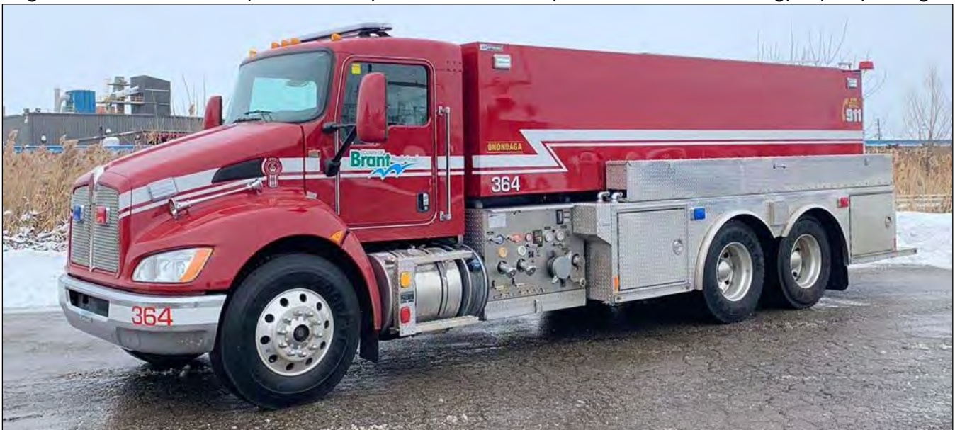
Brant County, ON just received this new tanker for Onandaga. T.364 is a 2019 Kenworth T370/Dependable with a 500gpm pump and 2500gwt.