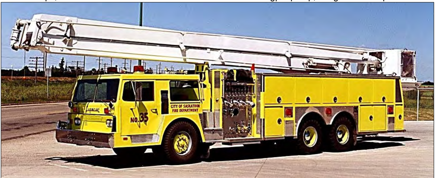
Saskatoon, SK had a 1974 Hendrickson 1871/Calavar Firebird 125' tower. In 1989, they sent it to Superior for a complete refit and had the Firebird replaced with a 85' platform. It had a 1050igpm pump and 300gwt.