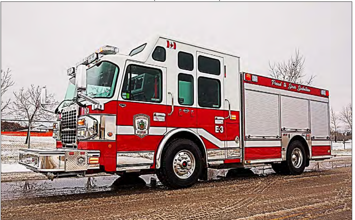
Saskatoon, SK new Engine 3, a 2019 Spartan Metro Star/Fort Garry pumper