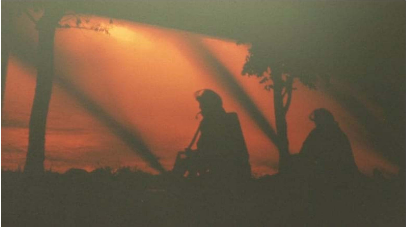
This photo hangs in the Wolfville Fire Department. It's a reminder of the physical dangers the volunteers face.

He said people are more open to talking about the mental toll these days, compared to when he started. Campbell will also look at if men and women need different types of help. "It's a male-dominated field. It's a lot of masculine values in the fire services: the hero, stoic, don't show emotion. As a female, in some ways, trying to live up to those masculine values can be difficult," she said. Campbell said attitudes are slowly changing.