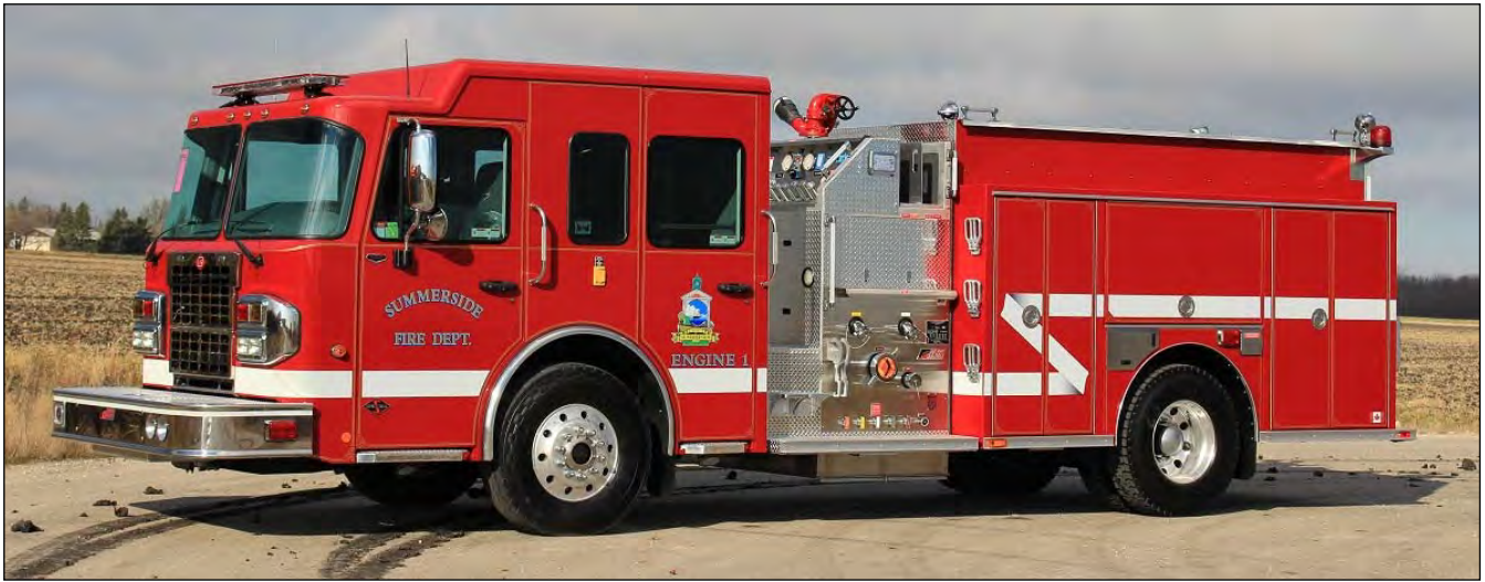
Summerside, PEI Engine 1, 2016 Spartan Metro Star/Fort Garry 1050igpm/800gwt/10gft s/n M755.