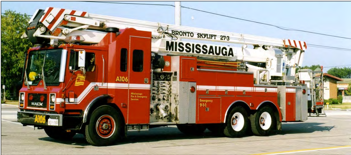
A typical early Bronto built by Anderson on a 1987 Mack MR chassis. Mississauga Aerial 106 had a 1250igpm pump, 125gwt and a 90' Bronto 27-3.