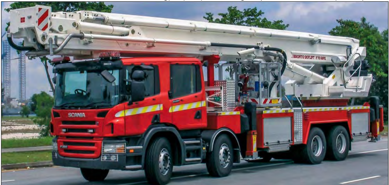
A 70m Bronto belonging to the Macau Fire Service, on a Scania 380 chassis.