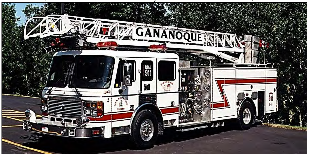
Gananoque, ON No. 2, a 2002 ALF Eagle quint, 1250igpm pump, 300gwt and 75' LTI aerial.