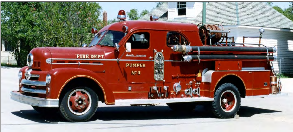
From Southey, SK Pumper No.3, a 1952 Bickle Seagrave 840igpm/300gt.