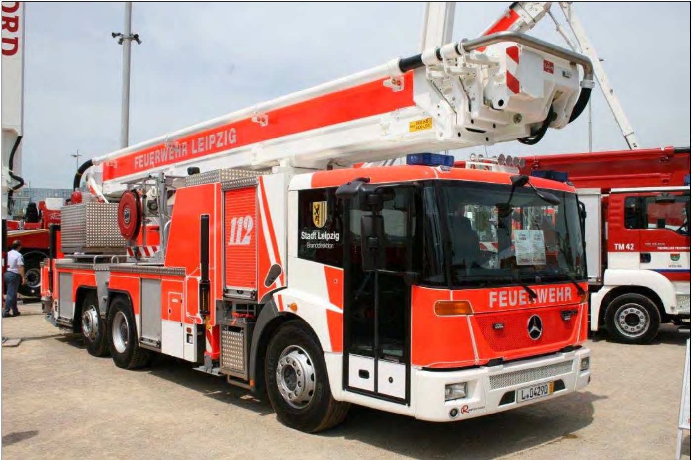
Seen at Interschutz 2012, a platform from Leipzig, Germany, this is a 46m Bronto H46 RPX on a Mercedes Econic chassis. Below is another Bronto, a TM42 RPX on a MAN chassis, from a volunteer brigade.