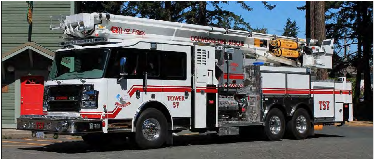
Colwood, B.C. runs this 2015 Rosenbauer Commander T-Rex, 115' tower. It has a 1750igpm pump and a 250gwt.