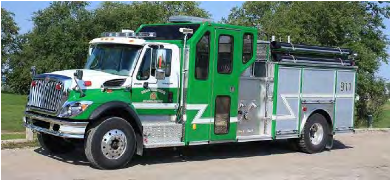
Killarney, MB Unit 4, a 2009 International 7500 / Green Acres pumper, 1250igpm pump & 1000gwt.