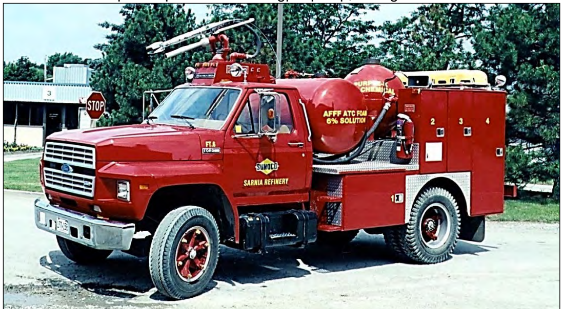
Suncor FT.6, 1985 Ford F600/Nordic 200igft/1000lbs dry chemical.