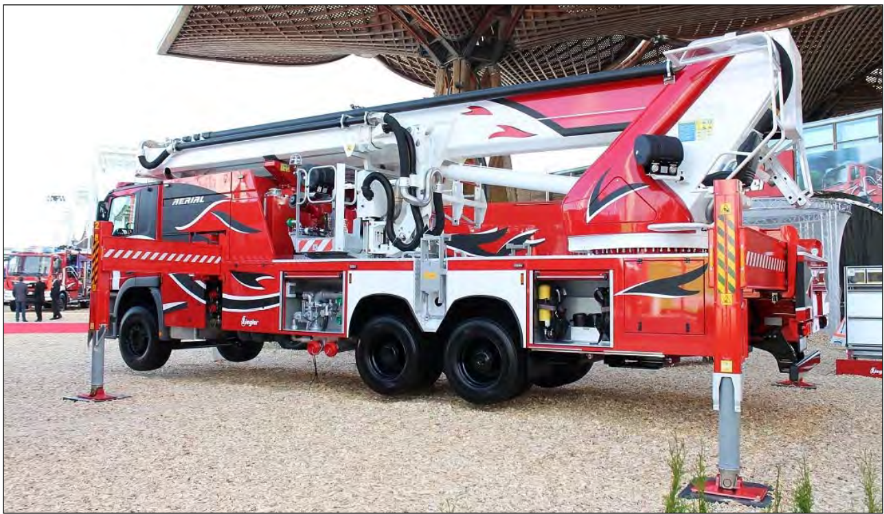
A Zeigler/Cela demonstrator at Intershutz 2015.