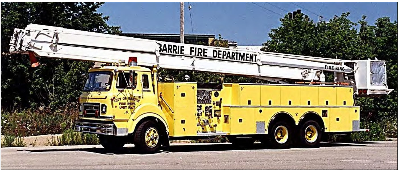
Barrie ON Unit #7, a 1980 International/King Seagrave 85' Fire King with a 1050igpm pump.