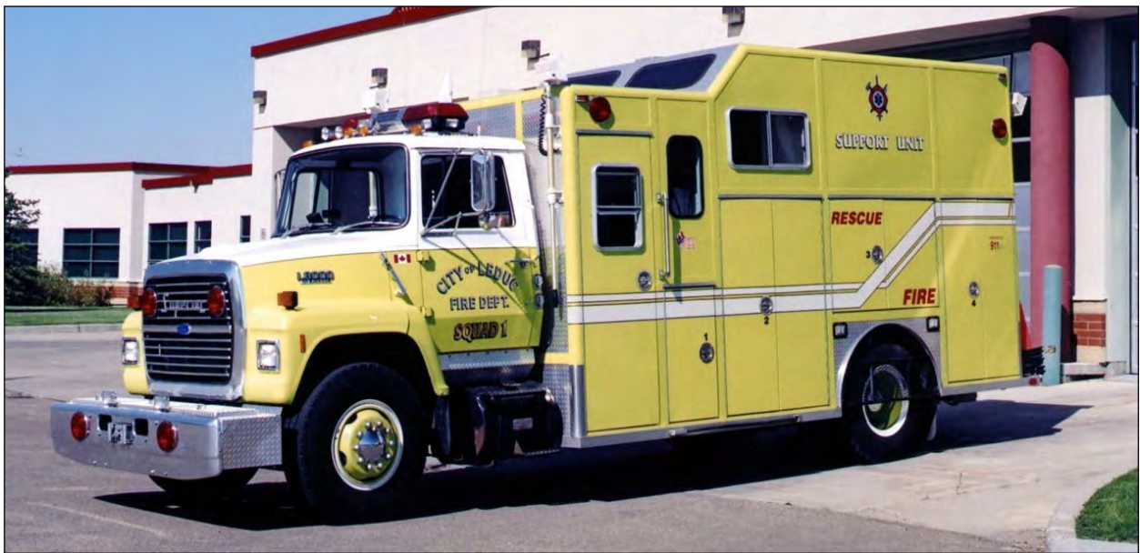
Leduc County, AB Squad 11988 Ford L8000 Superior SE904