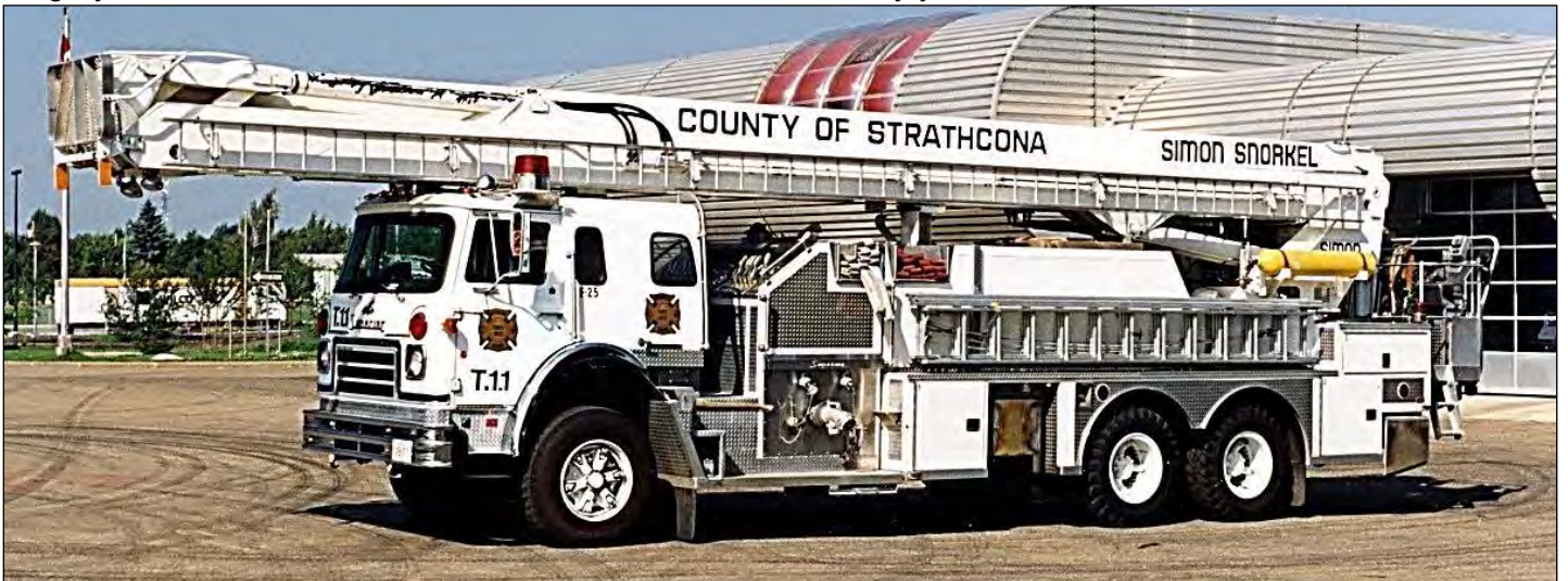
Strathcona County AB T1.1 1982 International Superior, 1050igpm/250gwt/103' Simon Snorkel. SE361