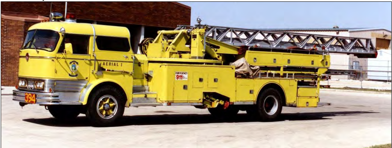
Winnipeg, MB Shop No. 394 was a 1960 Mack C-series 100' aerial.