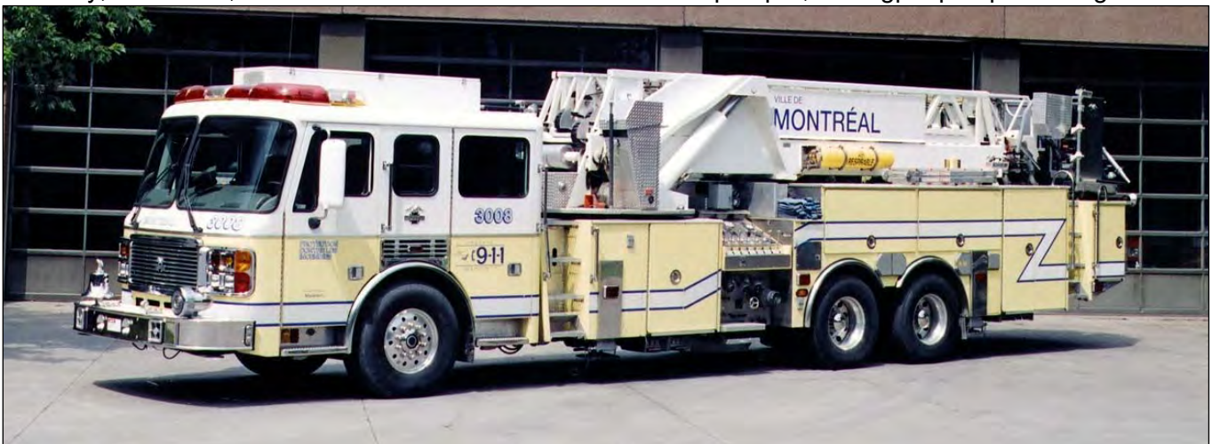
Montreal, QC 3008, a 2001 American LaFrance Eagle/LTI 93' platform. It has a 1250igpm pump and 300 gwt. It was originally with Montreal East and this was their colour scheme, it has since been repainted.