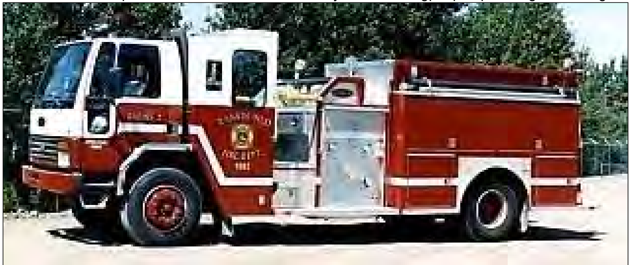
Rankin Inlet, NU Engine 2, 1990 Ford CF8000/1992 Superior pumper, 1050igpm/1000gwt. SE1250