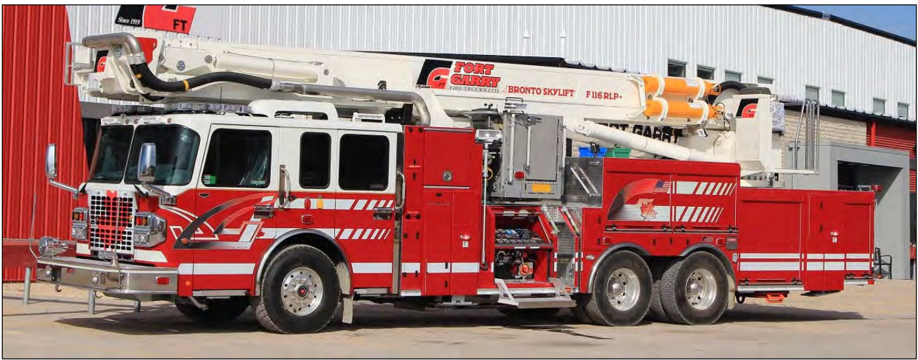
Fort Garry's original Bronto demonstrator, built last year on a Spartan Gladiator chassis. It has a 1500igpm Hale pump, 300gwt, a FoamPro 2001 foam system and a 115' tower.