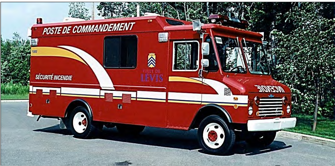
Levis, QC #1000 is a 1986 Chev Grumman Command Post