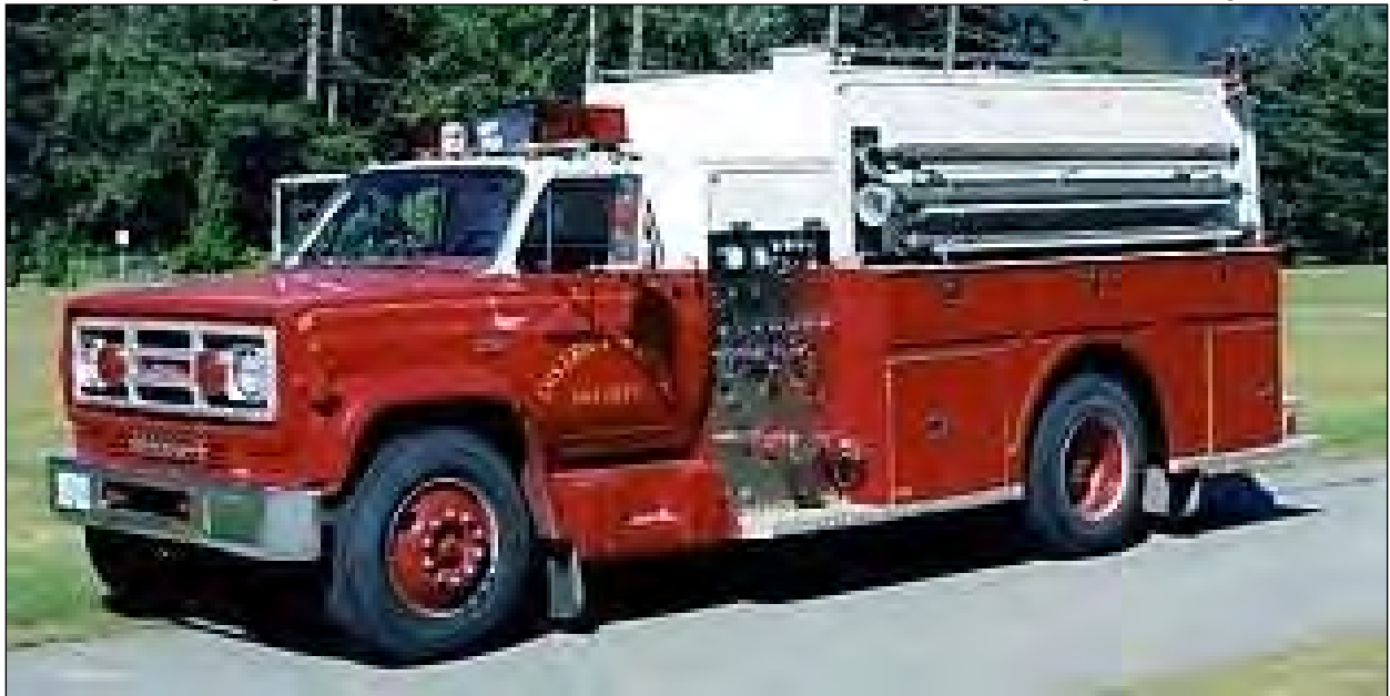
Hope, BC Tender 3-5, a 1981 GMC 7000/Thibault tanker with a 625igpm pump and 1200gwt.