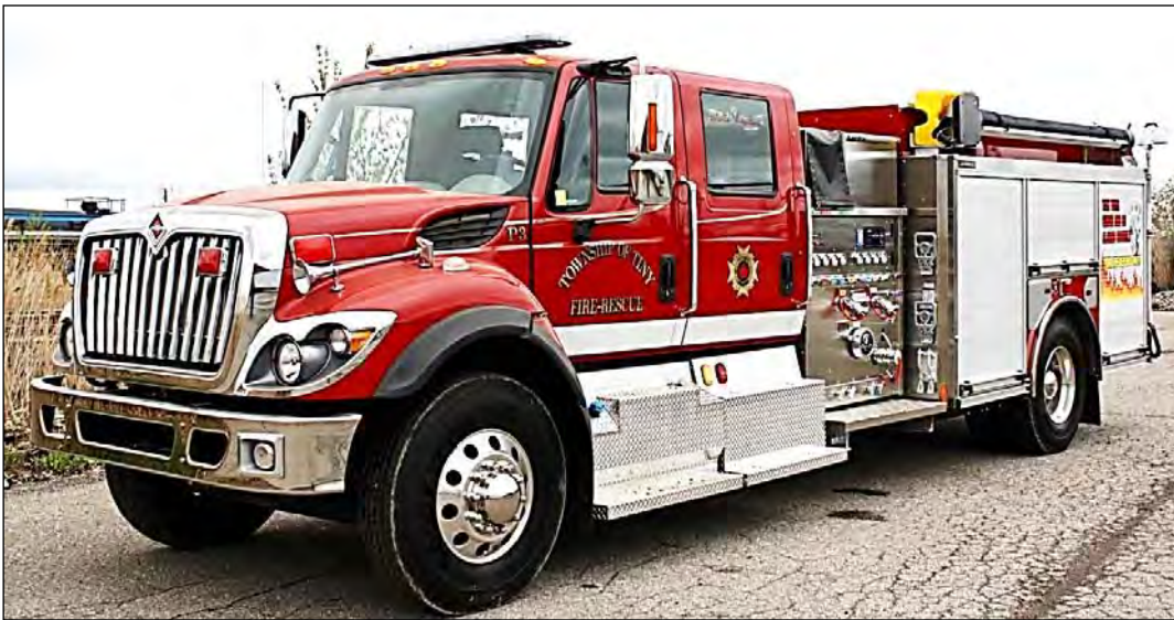
Tiny Township, ON Pumper 3, a 2019 International 7400/HME Ahrens-Fox, 1050igpm/835gwt.