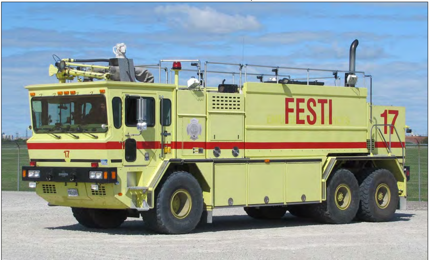
One of the former front-line CFR rigs now operated by the Fire & Emergency Services Training Institute (FESTI) next to the airport. Red 17 is a 1994 Oshkosh T3000 6x6 crash tender sporting a 1000igpm pump, 2400gwt, 142gft and 500 lbs. dry chemical.