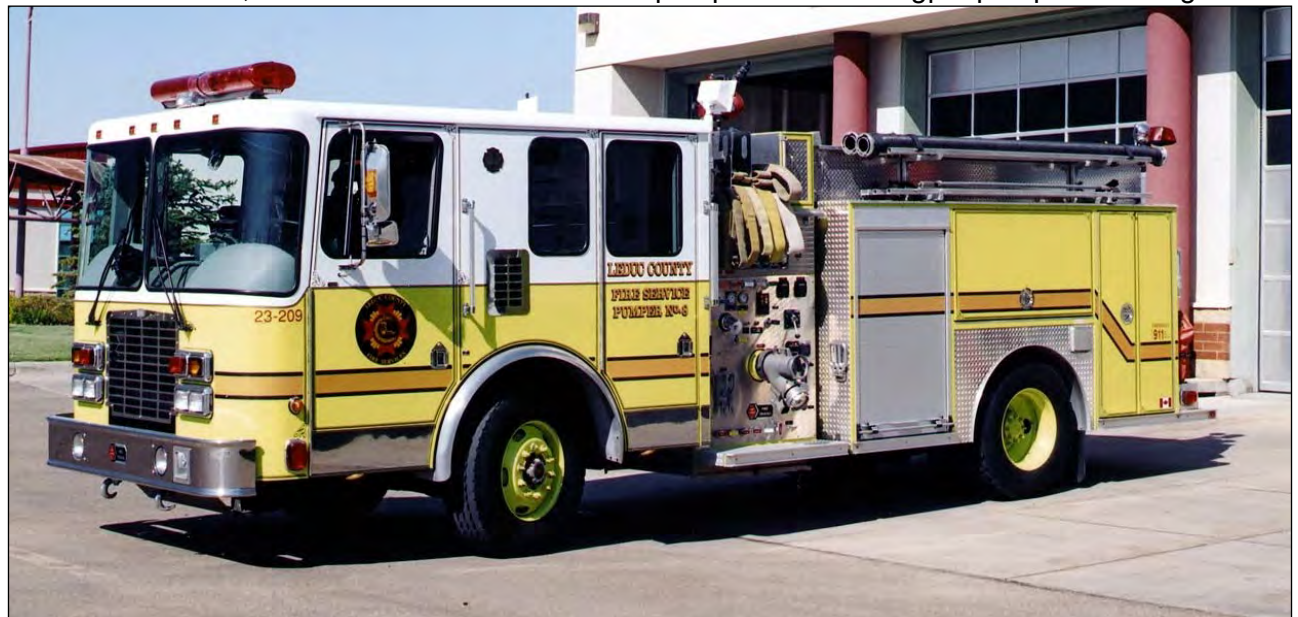
Leduc County, AB Pump 6 2002 HME 1871/Fort Garry pumper 1050igpm/1000gwt/24gft/10gft.