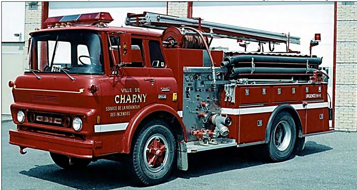
Charny, QC # 208 is a 1973 GMC 6500/Pierreville with an 840igpm pump and 500gtw.