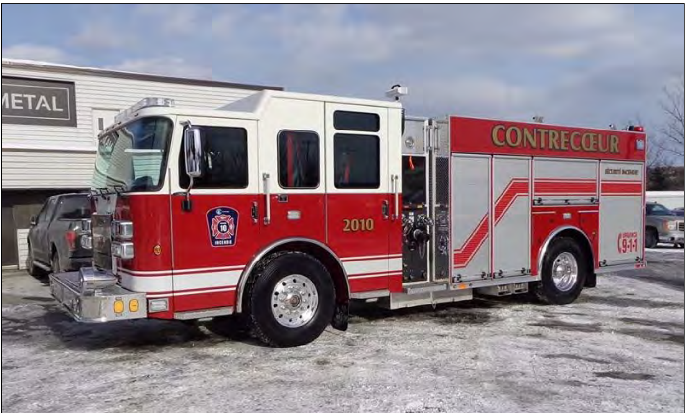
Contrecoeur, QC Unité 2010, a newly delivered 2019 Pierce Saber FR6010/Maxi Métal 1500igpm/600gwt