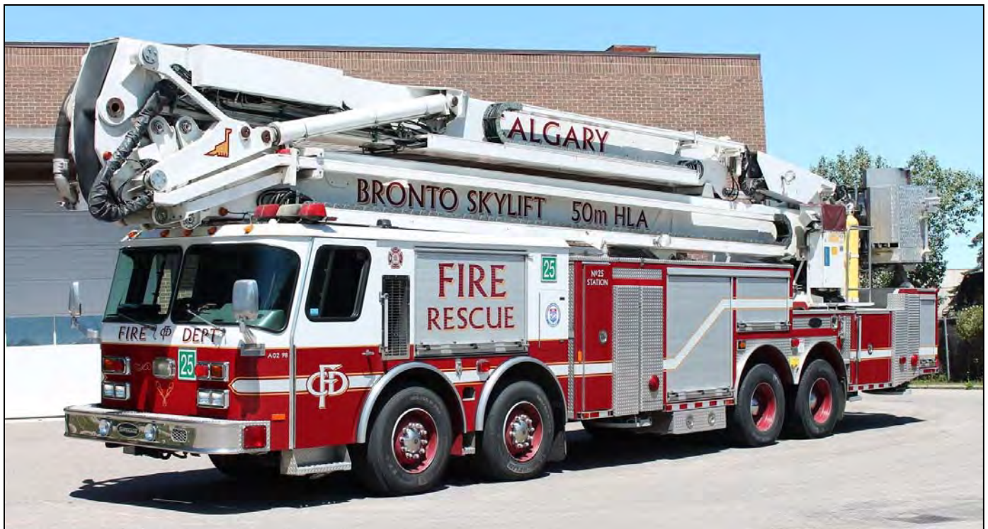
Calgary still has this 1998 E-One Hurricane/Superior/Bronto 50m HLA model, which ran as Bronto 25 when this shot was taken. It has no pump or water and is now in reserve status.

Stepping back in time to when Bronto first arrived in Canada, Montreal ordered a 22 m water tower direct from Finland in the early 1980's. Anderson looked after servicing that unit which started the partnership between Anderson Engineering and Bronto. Thunder Bay Ontario received the first Bronto unit that was completed by Anderson Engineering. The International Cargostar chassis was sent to Finland to have the Bronto 27-3 unit mounted and once returned from Tampere, Finland, Anderson completed the body and delivered the truck in the fall of 1986. Eventually Anderson Engineering was able to mount the Bronto unit onto the chassis at the Langley BC shops, saving much cost and time. In total Anderson Engineering delivered 42 Bronto units that ranged in height from 23 to 50 meters.