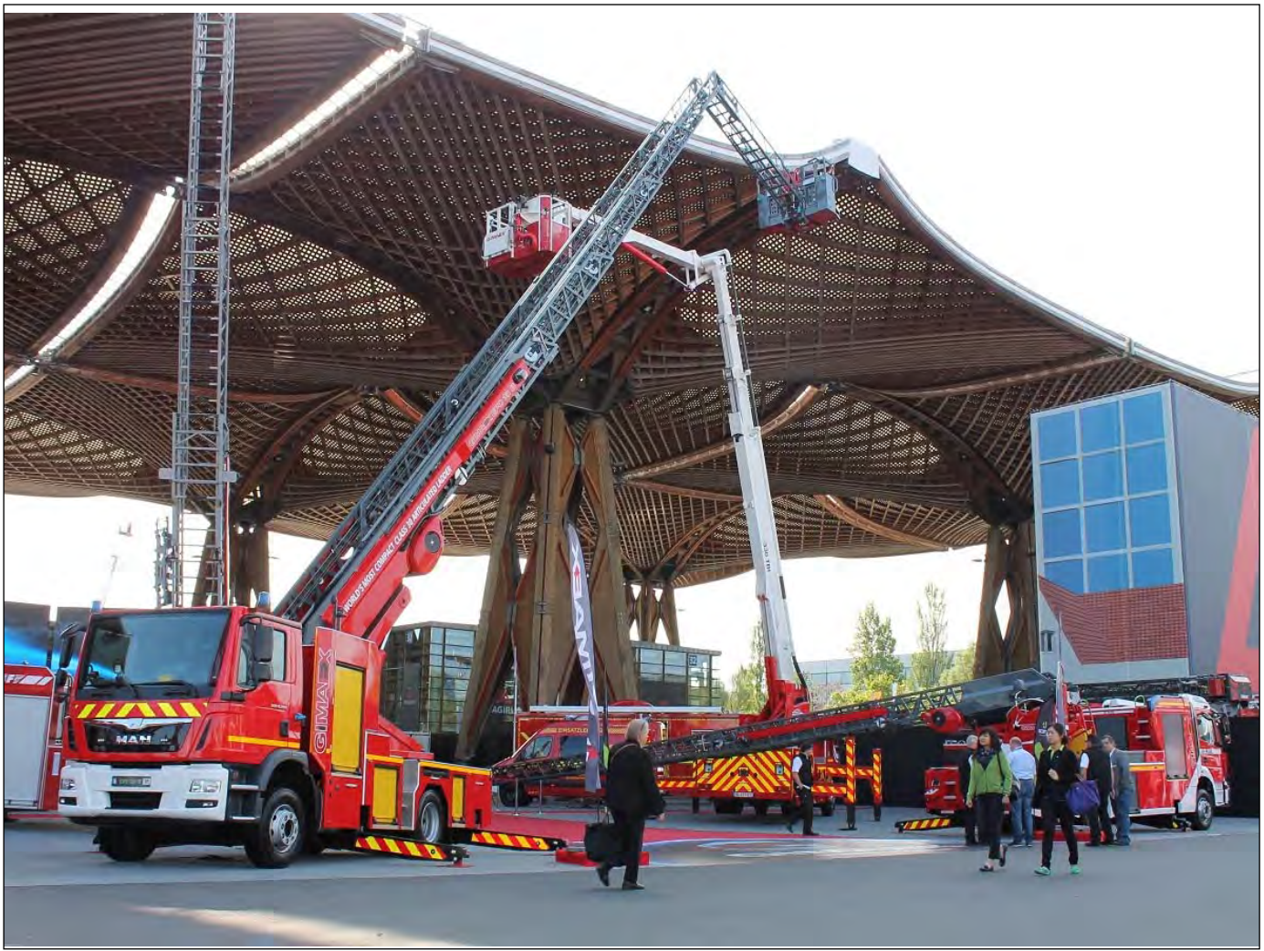
The Gimaex booth at Interschutz 2015.