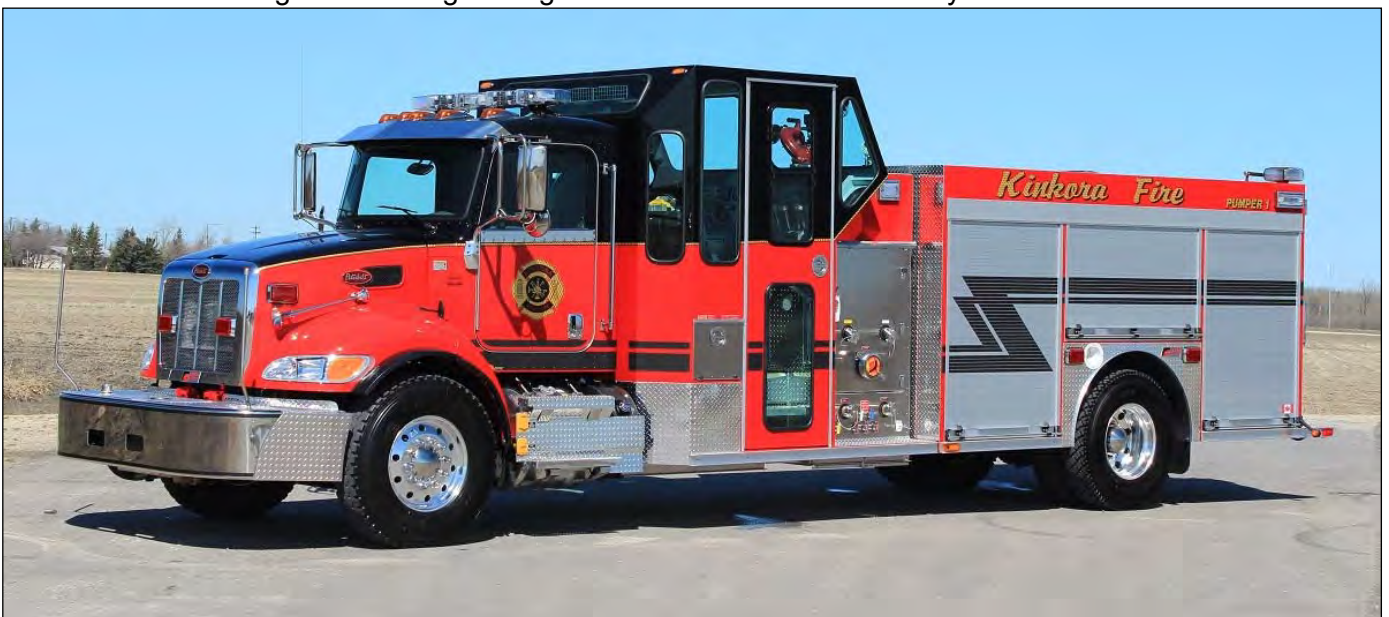
Kinkora, PEI Pumper 1, a 2015 Peterbilt 348/Fort Garry 1050gpm(W)/1000gwt/25gft s/n M624