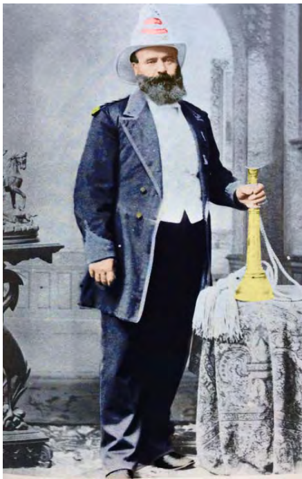
Looking back 125 years to Sunday January 27th, 1895.